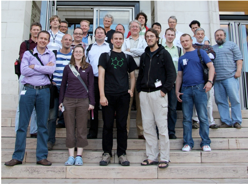
A subset of the participants, at the end of the meeting.