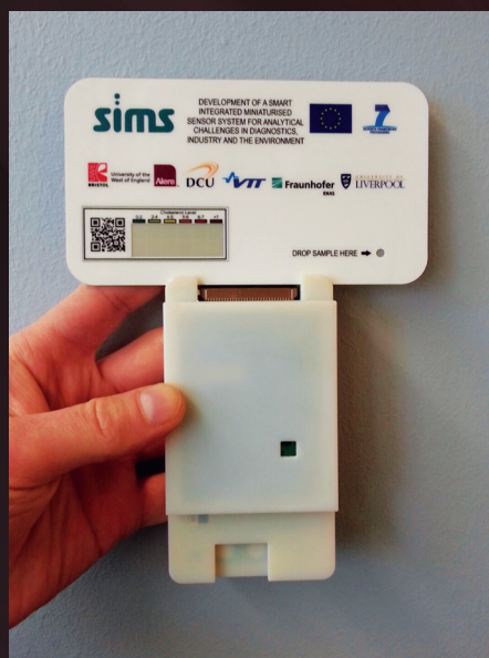
Current prototype of the SIMS device exhibited at LOPE-C in Munich, June 2013.

As the project advances, achievements may not be restricted to the measurement of cholesterol levels. Indeed, Killard foresees SIMS extending beyond its original aims and intentions: "SIMS will be most important in demonstrating what is possible with this type of technology, even if its application ends up being quite different to that envisaged here," he explains. "I could draw the analogy of the early personal digital assistants (PDAs) and smartphones that were revolutionised by Apple, not because they were especially technologically different, but because they had been more effectively targeted at the consumer. We will have to learn how to do that with organic and printed electronics technologies."