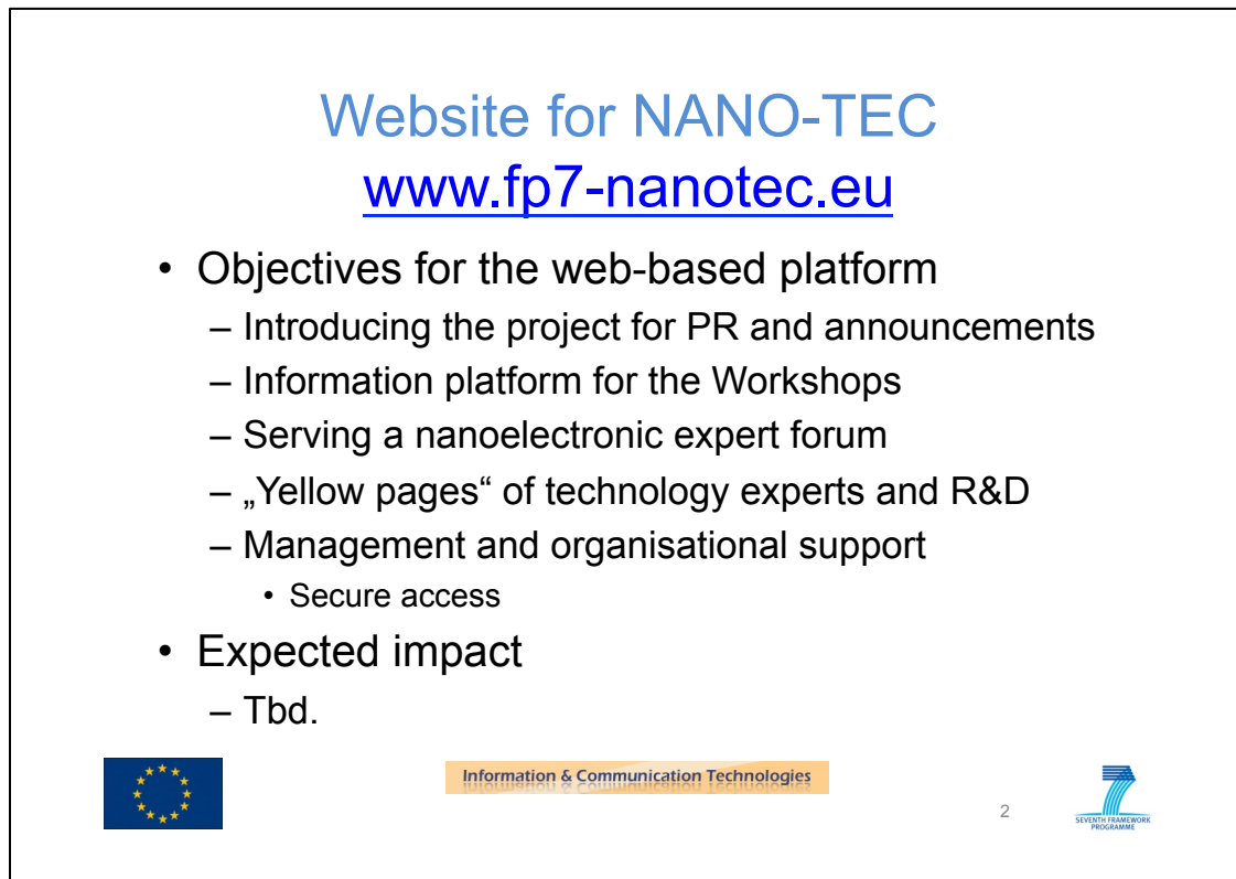
Figure 1: Announcement of NANO-TEC web platform made at the kick-off meeting

The web platform was announced during the kick-off meeting, as shown in Figure 1 , which represents the beginning of the relative presentation delivered by Volker Schöber (ECN), NANO-TEC Web Manager at the time of the meeting. The consortium received well the presentation and posed several questions in order to understand the applications of the web.