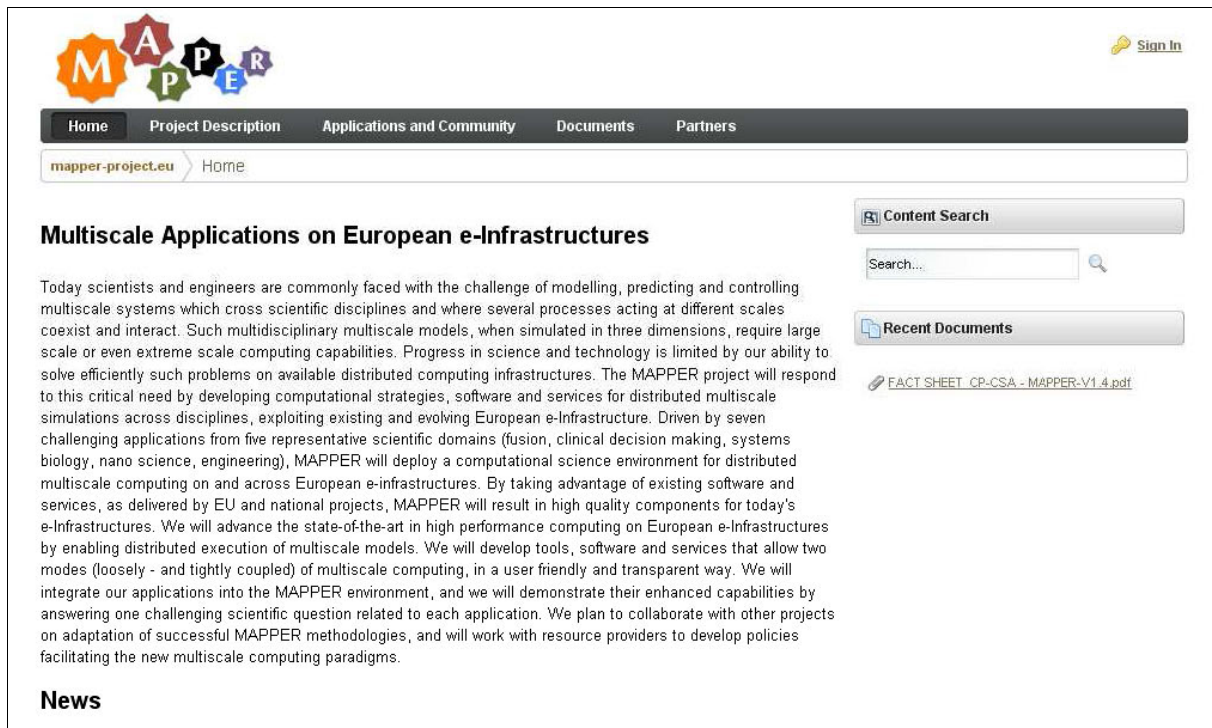
Figure 1: Screen shot MAPPER Home Page (as per end November 2010)

The MAPPER web site is based on wiki technology and it is divided in two sections: a public area and an internal area. The public area is available without signing in and it is maintained by the dissemination team. Each MAPPER community maintains their own part of the home page. These parts are also publicly readable. The internal parts require an authorized sign-in. Authorization is granted upon registration by the webmaster at the LMU MNM-team.