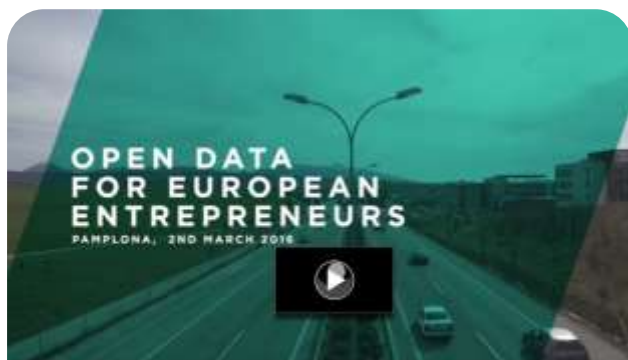
#myFIWAREstory: Finodex - the accelerator of Open Data

Other two milestones in the acceleration has been the organisation of different physical events with the network of entrepreneurs from FINODEX and other FIWARE accelerators. It is worth to mention the events organised by FINODEX like #FIWAREPamplona [ https://twitter.com/search?q=FIWAREPamplona ] or #FIWARETrento [ https://twitter.com/search?q=FIWARETrento ] in which the entrepreneurs had the chance to get dedicated training sessions on different topics, F2F sessions with investors and customers and even a pitch contest, besides tons of networking.