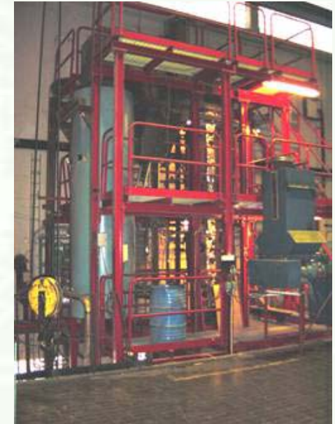
TPS - 750 kW