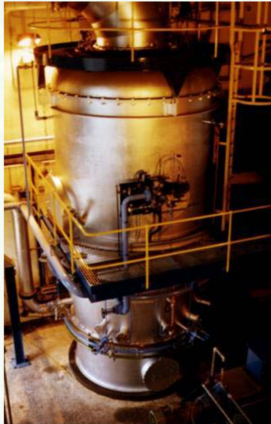
Wykes – 3 MW Plant