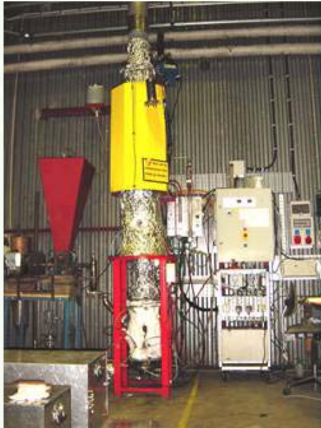
TPS - 20 kW