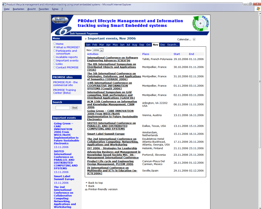
Figure 1: www.promise.no / important events

Among other things the www.promise.no website provides an overview on the project publications (deliverables, paper, presentations, etc) and events (see also Figure 1) related to the project such as conferences, information days etc.