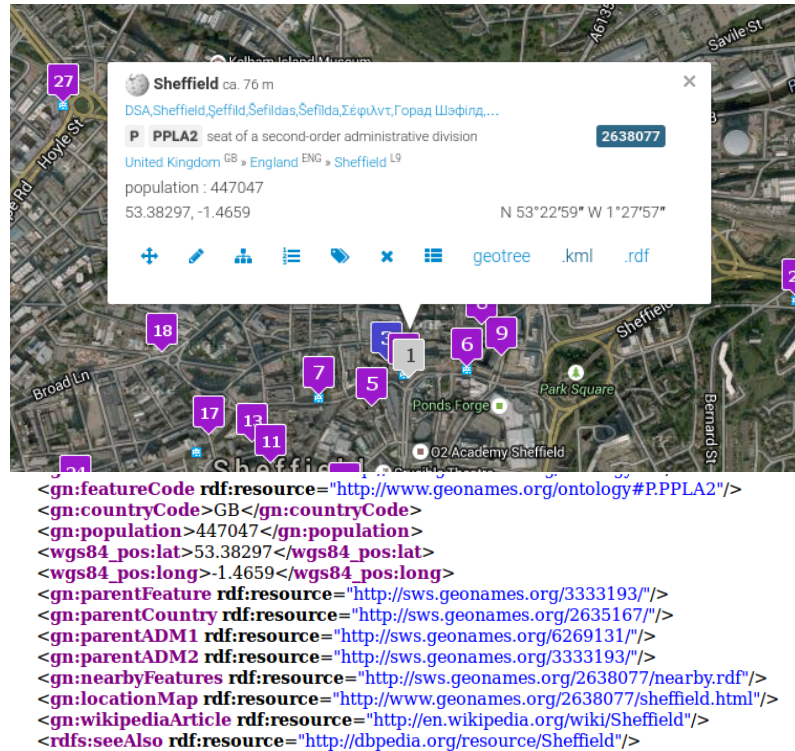
Figure 3.1: Geonames entry and XML for Sheffield. Note the DBpedia link.

Spatial grounding is achieved through three non-DBpedia mechanisms. Firstly, we ground in terms of latitude and longitude if these are available in the social media post’s metadata (which accounts for a growing proportion of work; (Sadilek et al., 2012)). Secondly, we use the Geonames linked data resource to connect location mentions to this extensive formal set of conurbations, political regions and geographical features (Figure 3.1). Finally, we map locations into the EU NUTS location space.