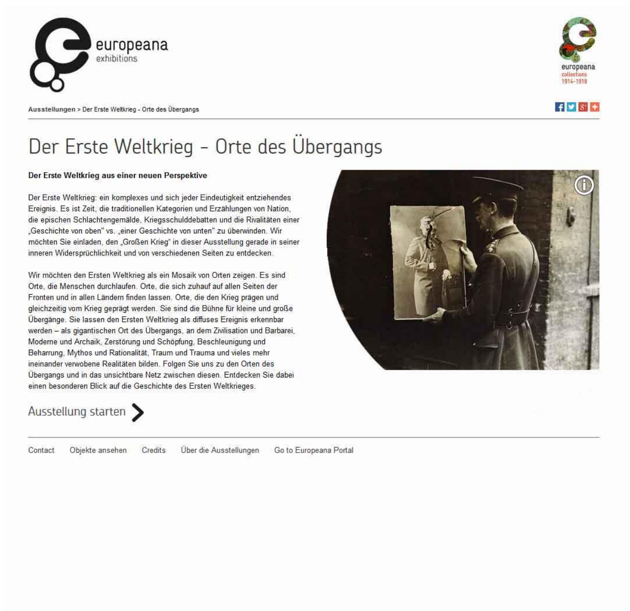
Figure 1. Start page of the virtual exhibition "Places Of Transitions" (German version)

The following screenshots demonstrate the structure and the concept of the virtual exhibition. The exhibition consists of nine so called themes , which represent the individual places of transitions. Each theme is built by three stories. Each theme is introduced by a short text and one object (picture, text) from one of the consortium partners. Then each story is assembled by a minimum of one up to three objects. Hence, in the exhibition concept a place (theme) is introduced, and the introduction is followed by a first story, then a second and third story; each with different objects from all consortium partners.