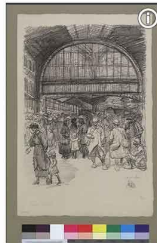
Hall of a station during wartime

Zu Beginn des Krieges wird der Personenverkehr eingeschränkt, später ist Zivilpersonen sogar gänzlich der Zugang zum Bahnhof verboten. Mit Fortschreiten des Krieges verändern dessen Anforderungen auch das Aussehen des Bahnhofs selbst. Notdürftig werden Lazarette oder Küchen eingerichtet. Als Knotenpunkte der Infrastruktur von hoher strategischer Relevanz fallen die Bahnhofsgebäude nicht selten der Zerstörung zum Opfer. Neben der militärischen Notwendigkeit ist dies aufgrund der physischen Größe und Wichtigkeit der Bahnhöfe auch von starker symbolischer Bedeutung.