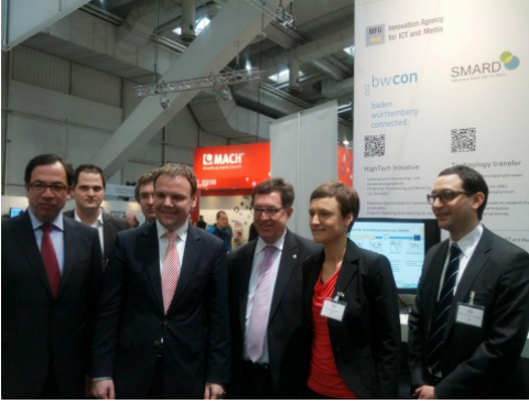
Delegation of State Secretary at SMARD Booth at Cebit