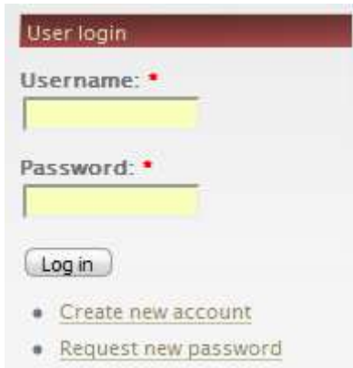
Figure 1: Login block with new account link