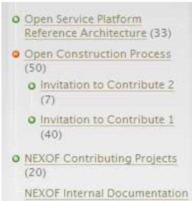
Figure 5: Navigation menu