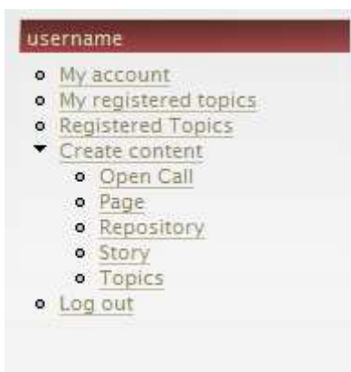
Figure 2: User Menu with creating content links