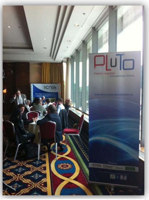
1 The PLuTO banner on display at the META-FORUM 2011

To a lesser extent, the use of press releases and feature articles in publications supports the project's dissemination efforts. This includes press releases issued in German and English at the commencement of the