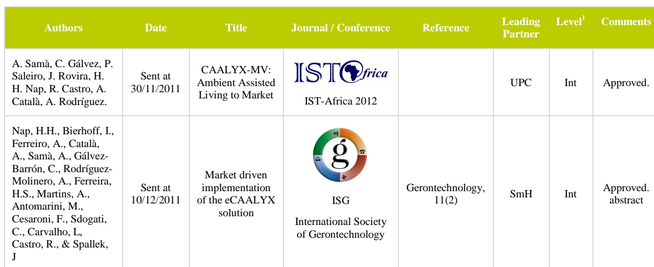
Table 1 – Publications

Suitable conferences and journals are listed in section 4.2.6 of D6.1.