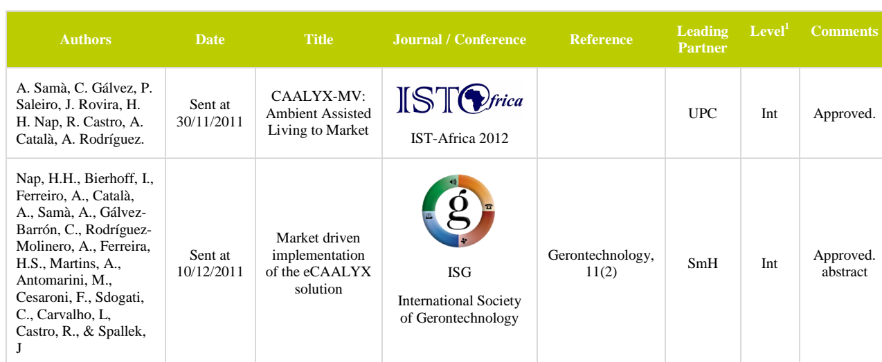
Table 1 – Publications

Suitable conferences and journals are listed in section 4.2.6 of D6.1.