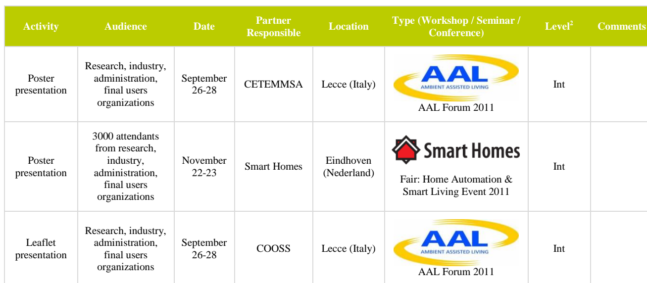
Table 2 – Conferences, Workshops and Seminars

Suitable conferences, workshops and seminars are listed in D6.1 section 4.2.7.