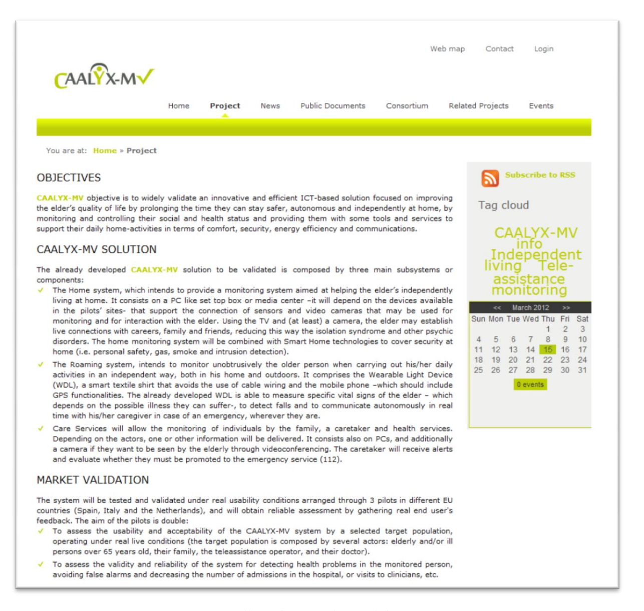
Illustration 1. Project Website