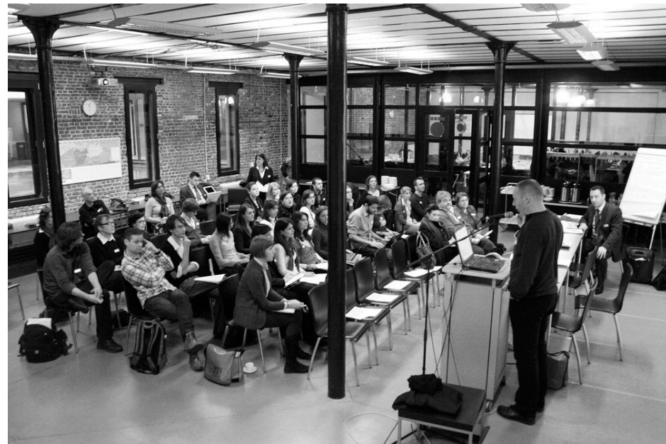
Kick-off meeting in Brussels (January 25, 2011)