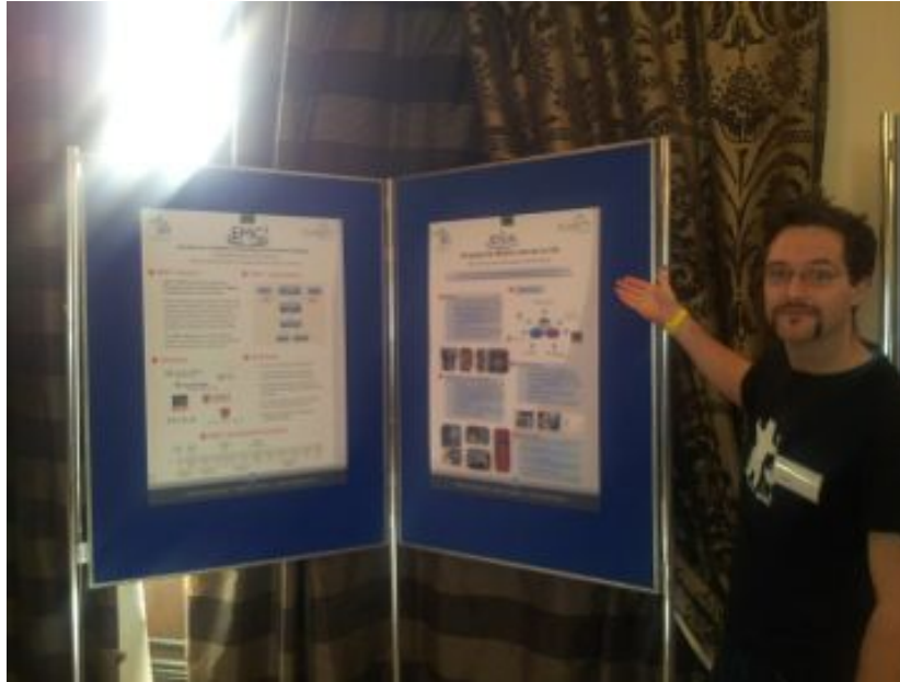
3DLife and EMC2 information posters in the poster and demonstration session, the main event of the open day