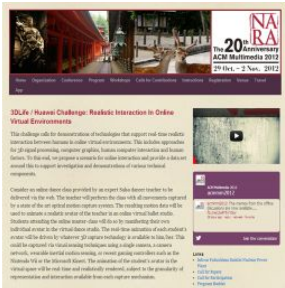
ACM Multimedia 2012 website

The 3DLife ACM Multimedia Grand Challenge 2012, sponsored by Huawei, was successfully held in Nara, Japan. Despite low acceptance rate of this conference there were two accepted papers for the 3DLife Grand Challenge 2012 including 1 from the 3DLife consortium.