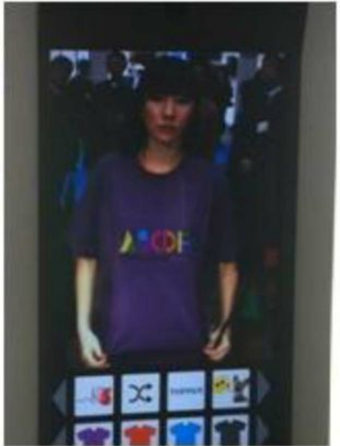
HHI Virtual Mirror Demo in RETAILTECH JAPAN 2012

marketing, or warehouse and distribution to enhance the efficiency of business matching between visitors and exhibitors.