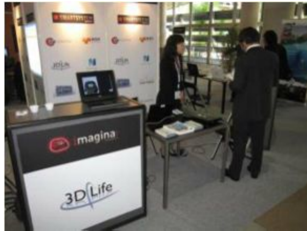
3DLife demonstration booth in Imagina 2011