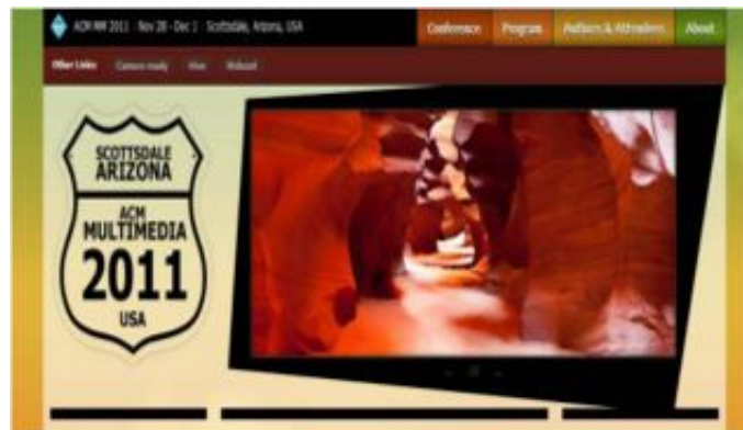
ACM Multimedia 2011 website

3DLife delegates attended the ACM Multimedia 2011 international conference that took place in Scottsdale Arizona 28th Nov – 1st Dec 2011. A 3DLife challenge within the conference was well attended and several 3DLife talks were presented there.