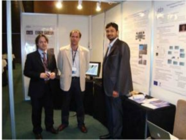
3DLife booth in NEM Summit 2010