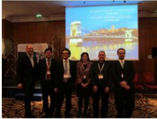
3DLife delegates in Future Internet Assembly 2011