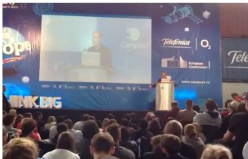
Key-note talk by Sir Tim Berners-Lee during the event

Attendee: Researchers and professionals from both academic and industry