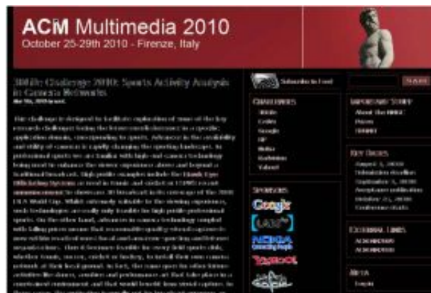
ACM Multimedia 2010 website

A 3DLife grand challenge titled “Sports Activity Analysis in Camera Networks” within the ACM Multimedia 2010 international conference was co-organized and supported by 3DLife, ACM MM, and Technicolor. This challenge focused on exploring the limits of what is possible in terms of 2D and 3D data extraction from a low-cost camera network for sports. To date, the 2010 Grand Challenge Dataset has been downloaded by 29 groups from research institutes, ICT companies, universities and other organizations worldwide.