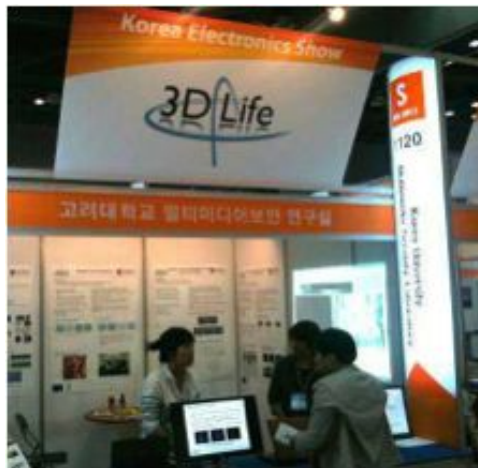
3DLife booth at KES 2011

KES is one of the most important events on showcasing electronic products from electronic companies worldwide. It is also an event that demonstrate the insight of future trends of the advanced technology and the global markets. A 3DLife booth was setup in this event and aspects of 3DLife project were presented to both professional attendees and general public. KU presented its web camera based application for detecting motion vector in the exhibition booth.