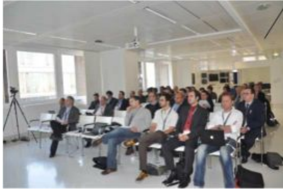
Delegates attending in the presentation during the workshop EMC 2 workshop