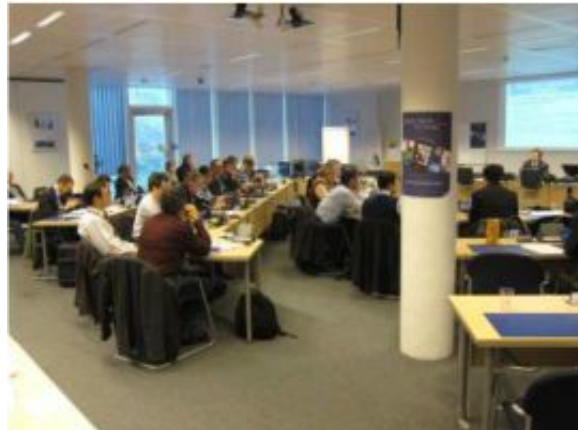
6 th FP7 Networked Media Concertation Meeting

3DLife delegates attended the 6 th FP7 Networked Media Concertation meeting which facilitated the communication between the EC and FP7 project managers and between the project managers themselves.