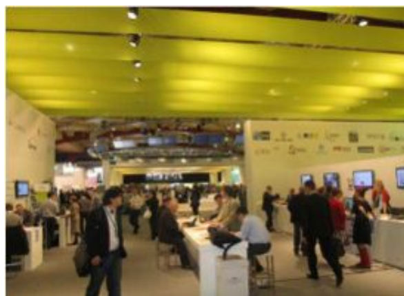
ICT event 2010

3DLife delegates attended the ICT event 2010. At this event, organized by the European Commission, researchers from all parts of Europe and beyond presented their latest work in ICT innovation as well as close-to-market projects. More than 200 projects were displayed over 10,000 square meters, with exhibits from research institutes, ICT companies, universities, public authorities and non-profit organizations.