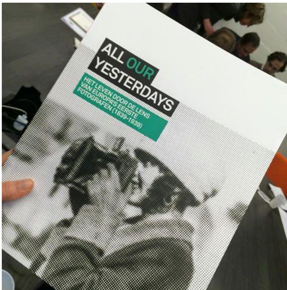
The second edition of the catalogue, in Dutch

“A third publication – a cahier (both in English and in Dutch) devoted to the Leuven collection displayed in Tweebronnen, boasting new articles and essays – will be published shortly after the vernissage.”