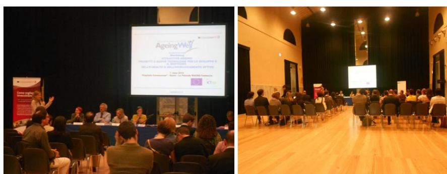
Figure 2 – 2 nd National Event of the AgeingWell Network, Rome (IT)

This event focused on the showing, explaining and sharing of experiences and knowledge on e-Health and Active Ageing ICT Italian best practices. It also meant to give actors of the ICT/e-Health/Active Ageing world the opportunity to meet each other and to share their experience and knowledge in order to gather feedback and improvements for future successful strategies.