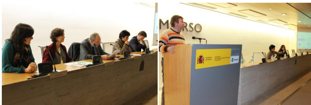
Figure 4 – 4 th National Event of the AgeingWell Network, Madrid (ES)

The initiative involved around 53 participants from public and private organisations interested in ICT technologies for the treatment of Parkinson's disease, which were engaged in a live joint discussion and experience share.