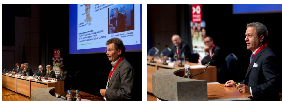
Figure 5 – 1 st International Event of the AgeingWell Network, Eindhoven (NL)

The first international event of the AgeingWell Network devoted to the topic “ICT for Ageing well Finance Marketplace” took place as the AAL Venture Days , a sub-event focused on access to finance and growth organized under the banner of the EC Ambient Assisted Living Joint Programme and their annual AAL Forum. Held in Eindhoven, the Netherlands, the event had around 200-250 participants at the AAL Venture Days-sessions on the 25 th and 26 th of September. This event incorporated presentations (pitches) made by 20 high-growth entrepreneurs with ICT solutions that improved the (quality of) life of an ageing population, as well as presentations made by venture capital investors and corporate venture investors and allowed numerous personal meeting opportunities for entrepreneurs.