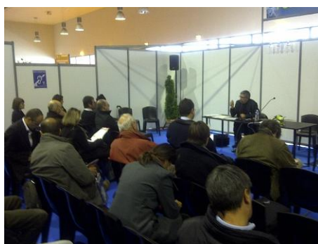
Figure 3 – 3 rd National Event of the AgeingWell Network, Marseille (FR)

This conference was focused on how new technologies, especially ICT, could be used to help disabled and elderly people be more autonomous and continue to live at home by performing routine tasks without external assistance. About 30 people, professionals, associations and large public participate to the conference. By the end, Q & A session was open and it was an occasion to give to the present public an overview of the AgeingWell project and objectives.