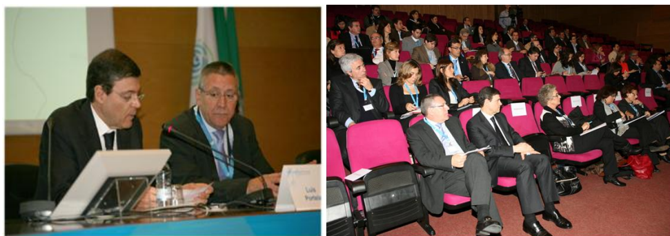
Figure 1 – 1 st National Event of the AgeingWell Network, Porto (PT)

Organised by HCP with the support of the partners INOVA+, TcP, and e-Unlimited, it took place on the 19 April 2012, at the Portuguese Institute of Oncology of Porto (IPO-Porto). The initiative gathered around 150 participants to exchange knowledge and practical experiences and to discuss topics related to the challenges and opportunities underlying the demographic changes that Portugal and Europe are facing with special focus on the opportunities and impacts for ICT and Ageing technologies.