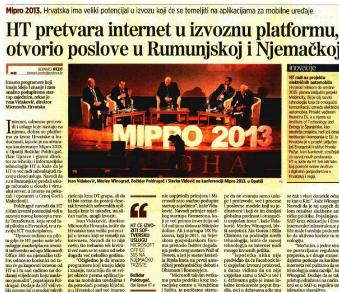
Figure 2. MIPRO magazine article

Media response of the HT's MIPRO presentation was vast and number of national (Vecernji list, Poslovni dnevnik etc...) and EU relevant sources (Telecompaper, Parliament Magazine etc.) covered the project and presentation.