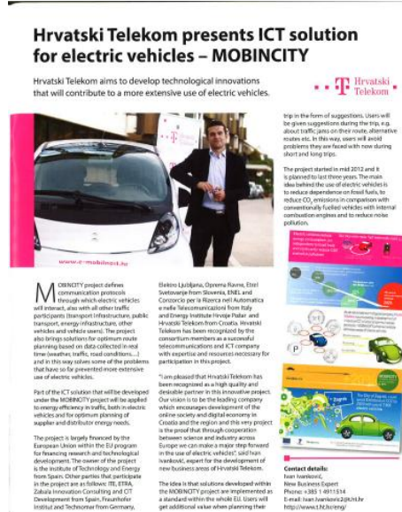
Figure 3. MOBINCITY Article in THE PARLIAMENT

The international journal THE PARLIAMENT published an article at issue 372 in June 2013.