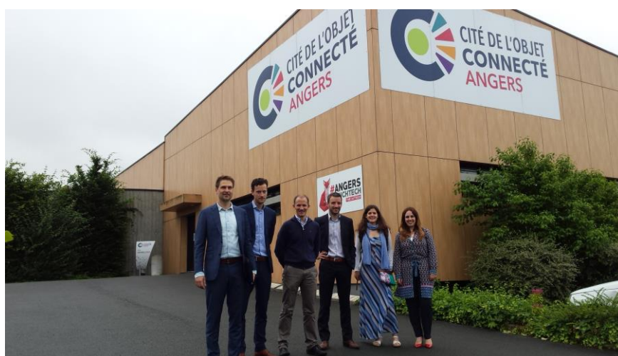
Figure 7 - IOT applied to the health sector

The IOT applied to the health sector: preventing, patient follow-up