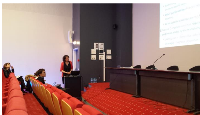
Figure 5 – Presentation in front of French hospital representative and decision makers

Place and date of activity: Rennes, France, 20 June 2016, Centre Hospitalier Universitaire,