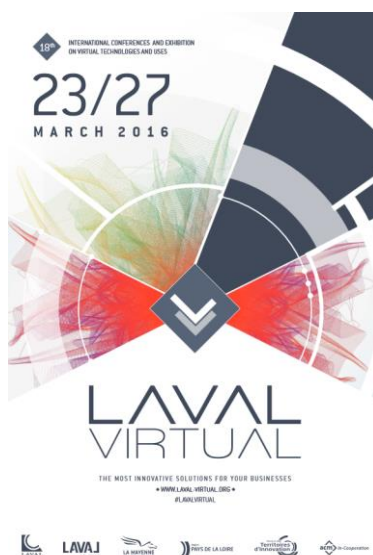
Figure 1 – Laval Virtual announcement