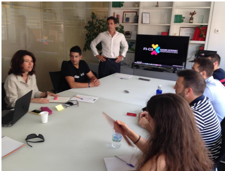
Figure 10 – Second Start-up Meetup and Business Coaching in Madrid

Legal aspect is a real concern for all FIWARE projects, and even if globally the law and rules are almost the same all across Europe, local specificities have to be taken into account by the projects.