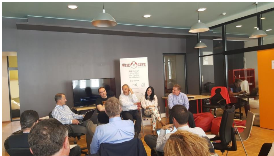
Figure 12 – Discussion about FIWARE Foundation, Tallinn, 28-29 Jan 2016