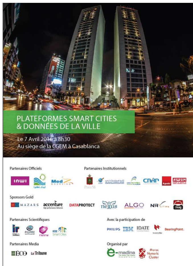
Figure 2 – Smart Cities platform event announcement

Professionals and consumers, in total 15 000 persons.