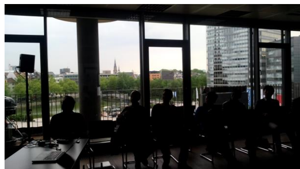
Figure 4 - Urbanbeers SME Networking event

Objective: The idea was to bring together SMEs including FI-PPP subgrantees with the global network of researchers participating in the City Lab workshop and allow for a productive idea exchange. It started with a quick presentation from the local stakeholders as well as an 1-minute madness-type presentation from the workshop authors and any other participant willing to do so (this allows everyone to be aware of each other’s interests and directs the interactions over the "Urban Beers"). The "Urban Beers" session took place in a location outside the traditional academic environment in order to facilitate the interactions.