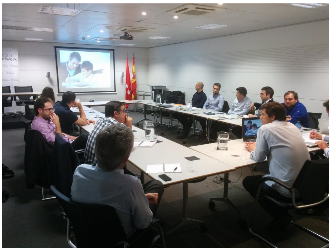
Figure 3 – Meetup of 28 April 2016 in Madrid

Place and date of activity: Madrid ICT & Audiovisual facilities (José Abascal 56, 3 rd floor, 28003 Madrid, Spain), 28 April 2016