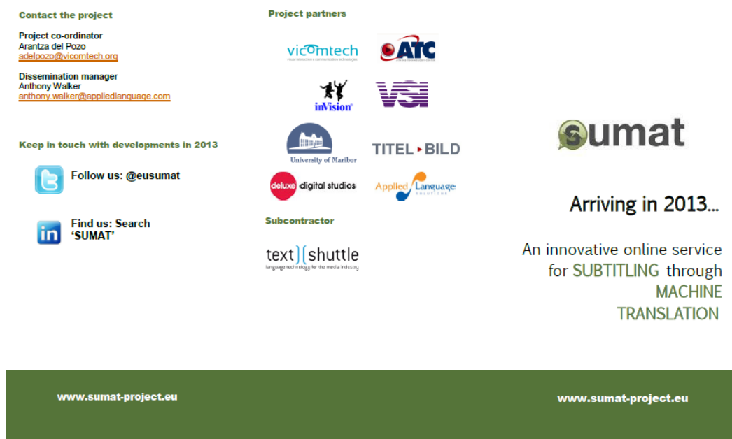
Figure 1: Leaflet cover