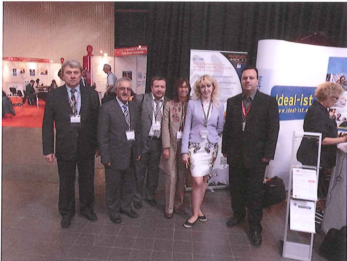
Figure 2: PICTURE consortium partners at ICT Proposers Day 2012, Warsaw, September 2012

To support such broad awareness raising and dissemination activities, the consortium developed the Awareness Raising and Dissemination Plan (ARDP) validated by all partners and submitted to the EC. In addition to this tool, the development of the project branding set has been completed and a broad branding stuff (including project logo, project leaflet, project banner, project letterhead, templates for Newsletter and project card) is uploaded at the project portal in the Partners area for the common use. Specifications for the new Web portal have been prepared and an updated version has been launched in March as planned. The first project newsletter has been edited in November 2012.