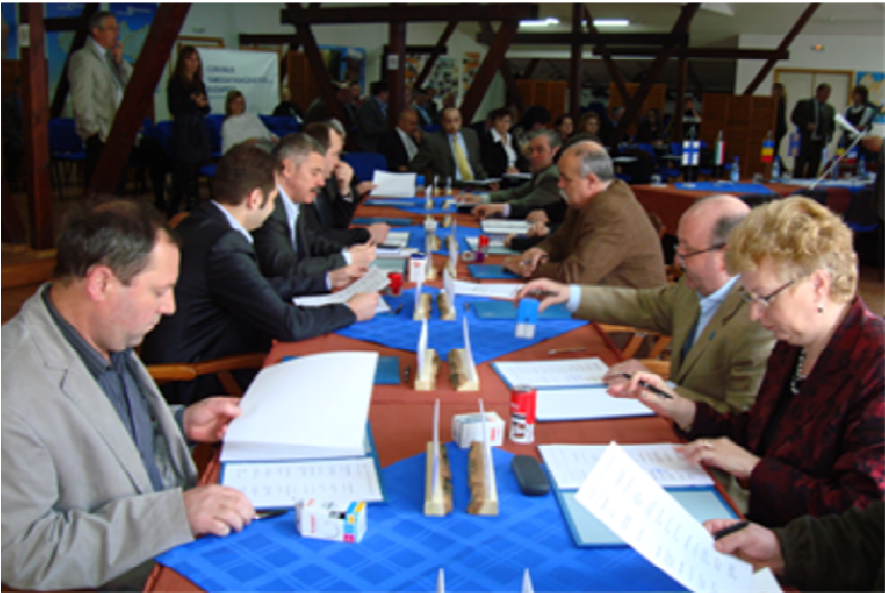
Formal signature of the Cluster Forming Agreement, 19.04.2010, Sf. Gheorghe, Romania

Beside this PRO WOOD is regarded as a model project for the national cluster policy of Romania.