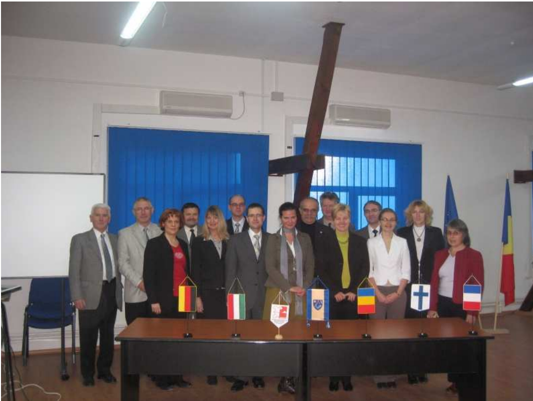
Project consortium at the Launching Conference in Covasna (Romania), December 2008

Beside the economic effects that an established wood cluster could have for the region Brasov-Covasna the cluster shall support the integration of the region into the European Research Area. Eight partners from Romania, Finland, France and Germany have formed a consortium. This partnership comprised the needed stakeholders on the Romanian side and the knowledge about cluster policy tools, wood research and business on the other side.