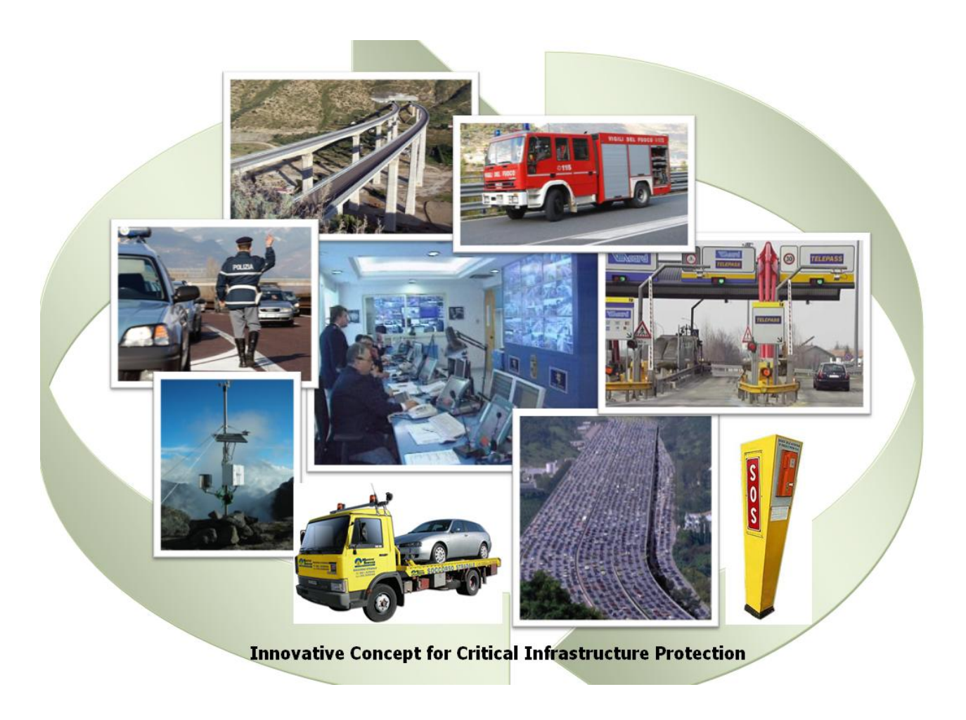
Figure 1: Ni2S3 Scenario

The activities within the project are articulated into seven work packages: