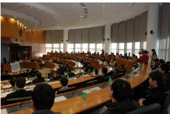
On the left: The audience of the HK Conference at the HK Polytechnic University.

The two conferences resulted in two reports that were posted on the RISE website and made available to the RISE stakeholder community. The HK Conference contributions were collected as post-conference proceedings in a book on "Ethics and policy of biometrics" published by Springer.