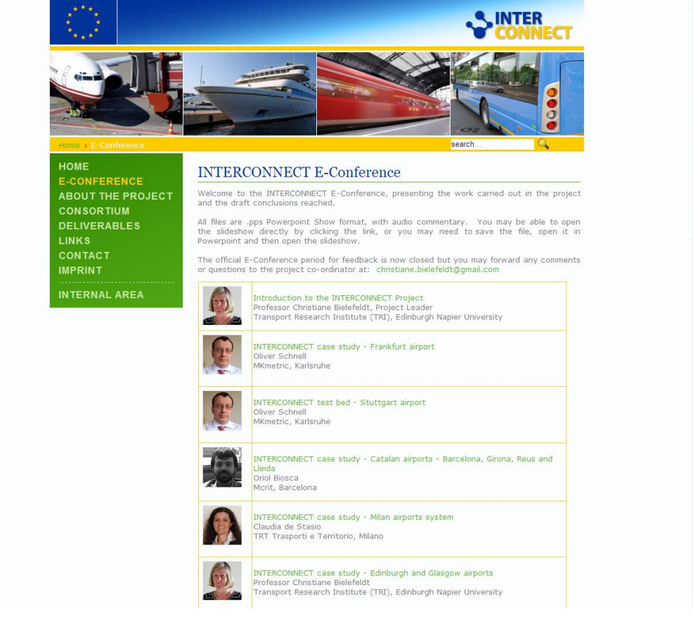
Figure 3-3 INTERCONNECT E-Conference screenshot (www.interconnect-project.eu)

Stakeholders could have downloaded PowerPoint presentations with audio commentary until 9th of May 2011. During this period they were able to send comments and questions regarding these presentations to the consortium. Afterwards, members of the consortium discussed and responded directly to all feedback received. In all the E-Conference had approximately 100 external hits from 2nd to 9th May 2011, which illustrates the number of visitors to the E-conference. The presentations will stay online and available to download on the project website for at least one year beyond the end of the project as they are part of the main results of INTERCONNECT.