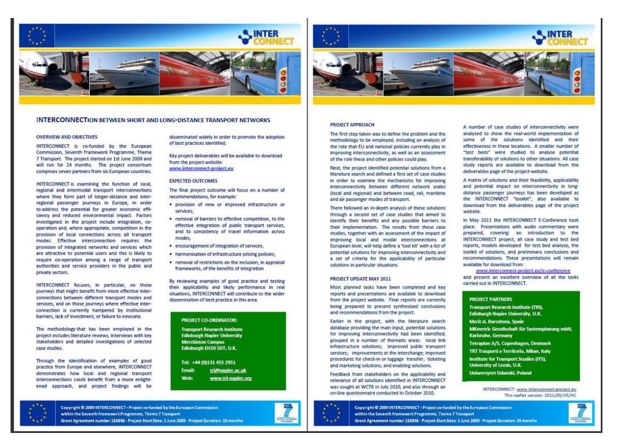
Figure 3-2 INTERCONNECT project presentation leaflet