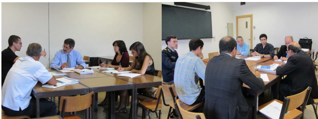
Pictures from the JAP consultation session in Braga, Portugal, June 2011.