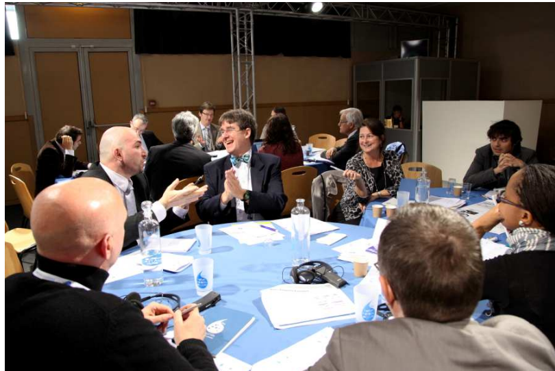
Session on water SPI on WWF6, where the generation of a collaborative JAP by many international initiatives was pushed forward by the EC representative and NOVIWAM took part on the dialogues.