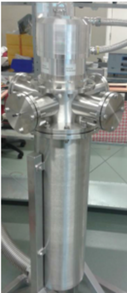
Cold head and vacuum chamber