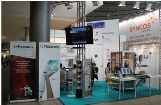
Exhibition at the Control Fair in Stuttgart