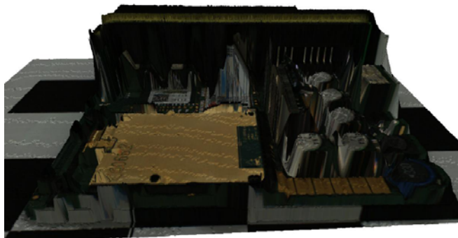
Scanning operation in the "extended 2.5D" prototype (left) and coloured 3D point cloud (right) for a test part.