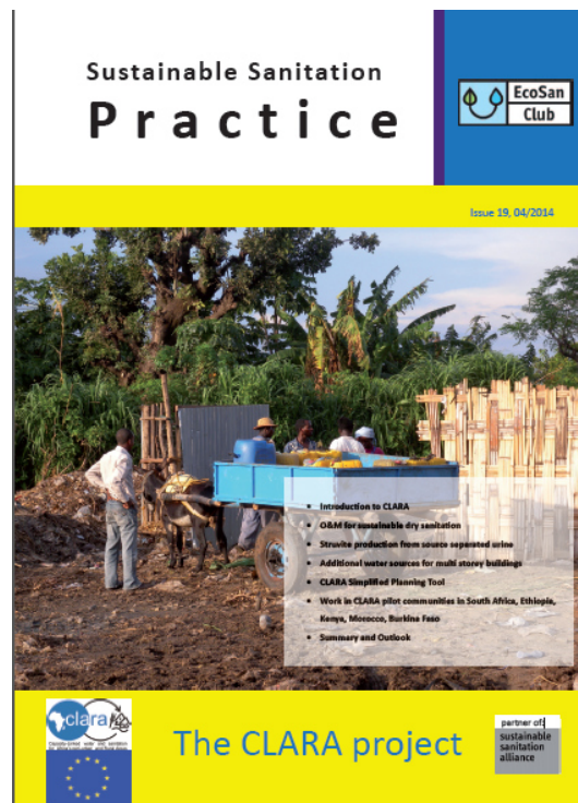
Figure 4: Title page of the CLARA special issue of the SSP journal