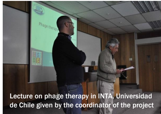
Lecture on phage therapy in INTA, Universidad de Chile given by the coordinator of the project