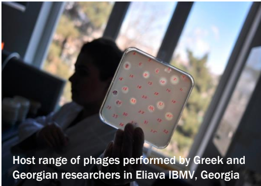
Host range of phages performed by Greek and Georgian researchers in Eliava IBMV, Georgia