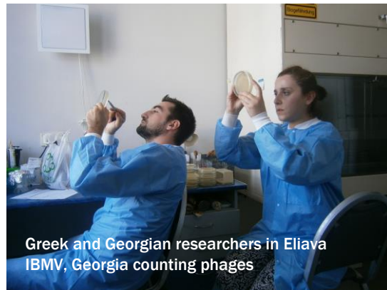
Greek and Georgian researchers in Eliava IBMV, Georgia counting phages