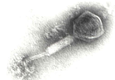
Phage against V. harveyi isolated from HCMR (TEM picture taken in Eliava IBMV)