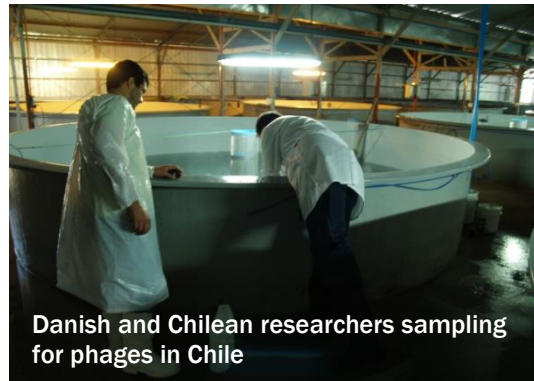
Danish and Chilean researchers sampling for phages in Chile