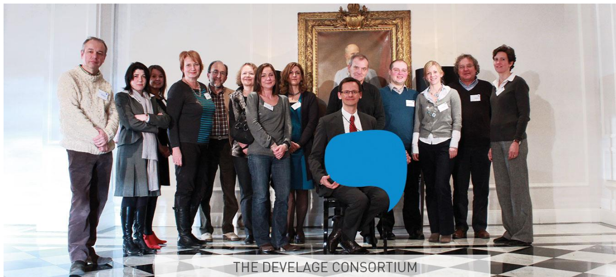
Figure 1: The DEVELAGE Consortium