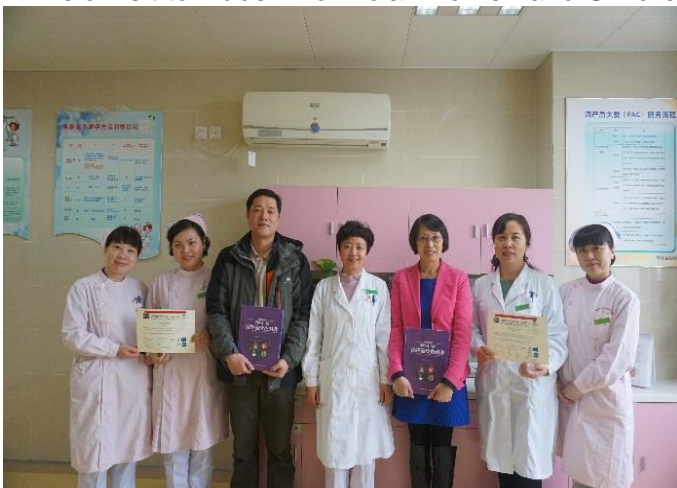
⑤ Intervention monitoring visit to Baoding Maternal and Child healthcare Hospital in Hebei Province, April 2016