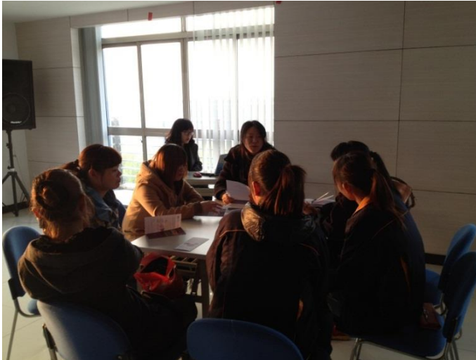
③ A field visit of quantitative data collection in Hebei, July 2013