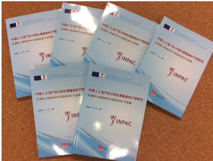
(11) INPAC Book