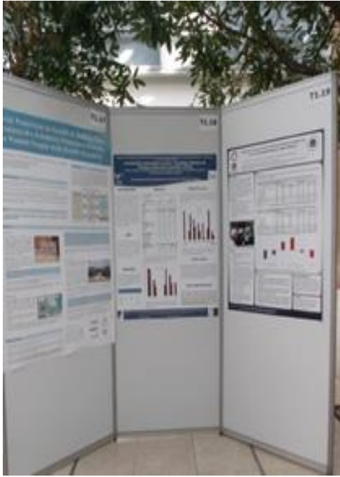
② E-poster presentation of INPAC project at the 14 th Congress – 2 nd Global Conference of the European Society of Contraception and Reproductive Health in Basel, Switzerland in May 2016