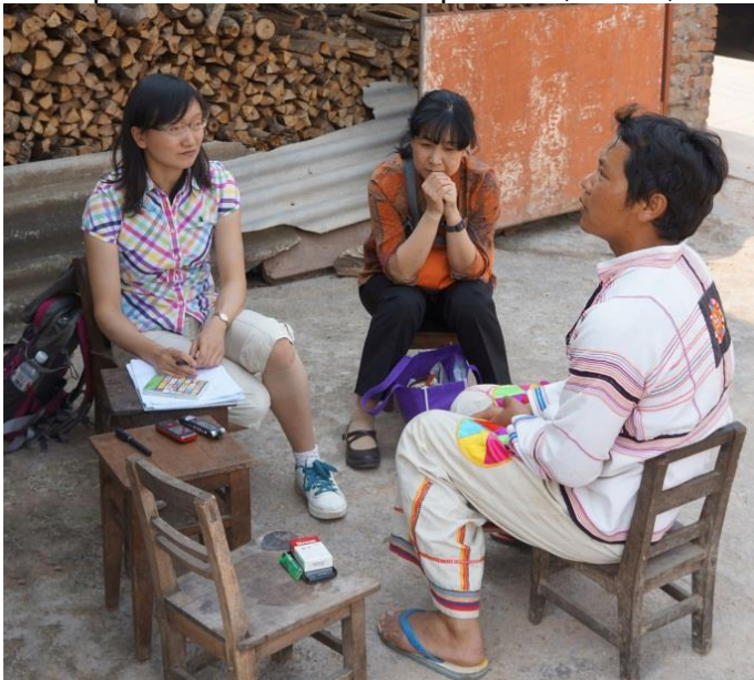
② Focus Group Discussion with youth in Zhejiang province, March 2013