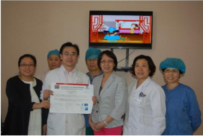
© INPAC project team visited Longyan Maternal and Child healthcare Hospital in Fujian, April 2016