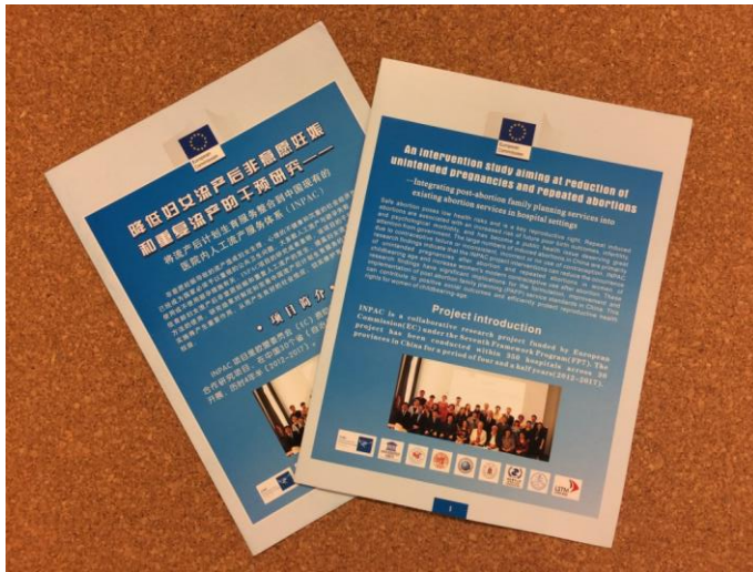
(8) INPAC Policy Brief