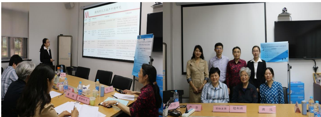
(5) Student passed Master's thesis defence successfully based on INPAC data