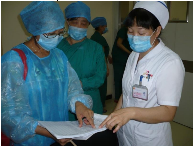
④ A Field visit to Hubei Provincial Women and Children Health Center, January 2016