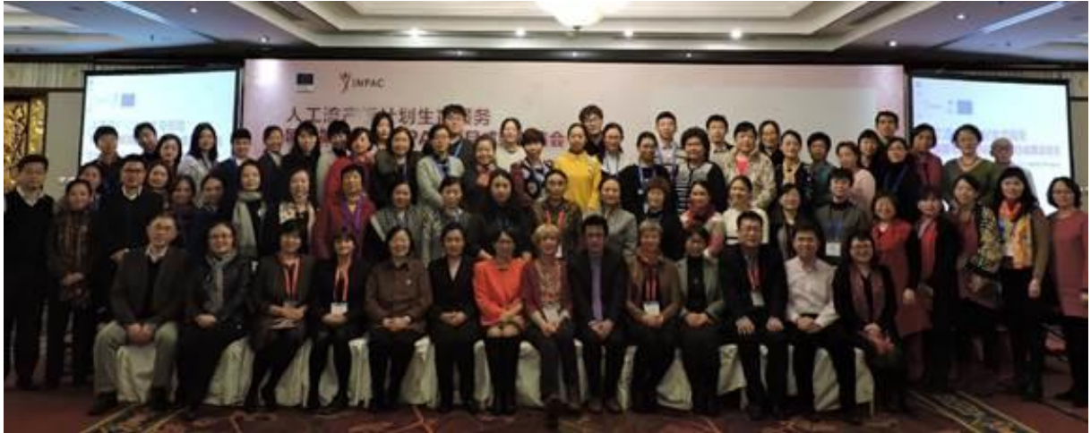
⑦ INPAC Final Dissemination Conference in Beijing, January 2017