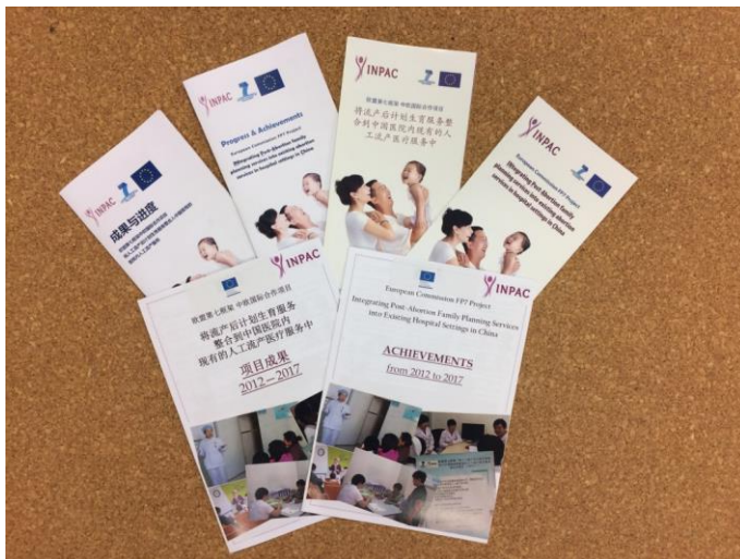
(7) INPAC leaflets