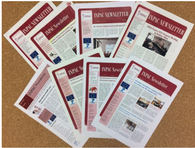
(6) INPAC newsletters