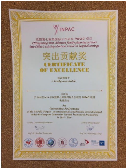
(10) INPAC certification