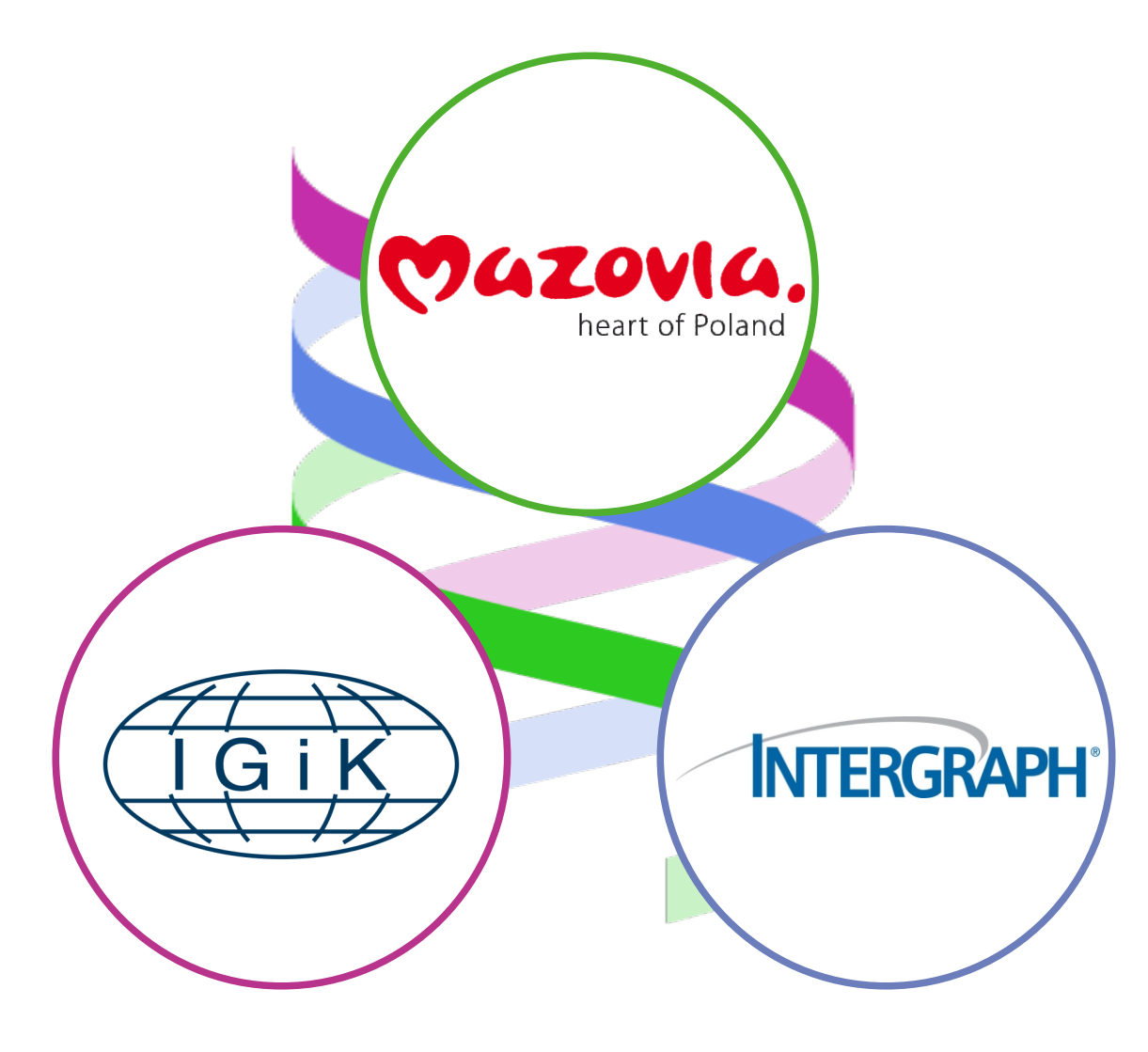
Triple helix partnership in Mazovia