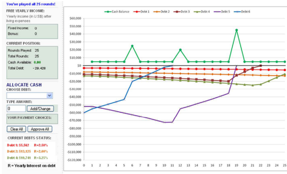
Figure 1 – The debt management game. This screen displays the behavior of a (hypothetical) financially optimal player, who consistently allocated all available cash to the open debt with the highest interest rate.

Dr. Shahar Ayal – Interdisciplinary Center (IDC) Herzliya