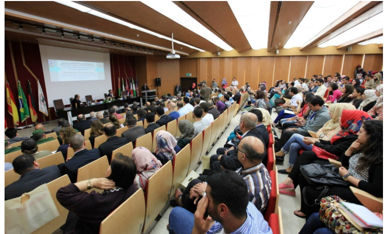
International conference at AAUJ - Conflict Transformation and Peacebuilding in Palestine - 5 – 6 May 2015

together leading researchers on the conflict in Israel and the occupied territory and will continue as an annual legacy of the CTMEE project.