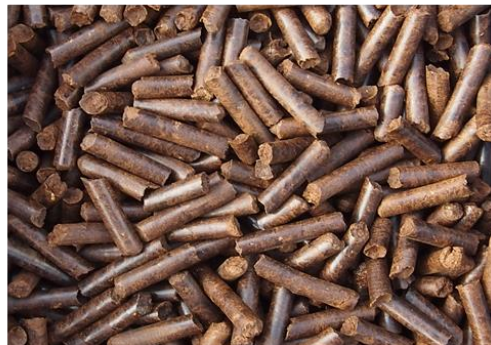
Untreated Willow and torrefied Willow briquettes (left) and pre-pelleted Triticale and torrefied Triticale pellets (right)