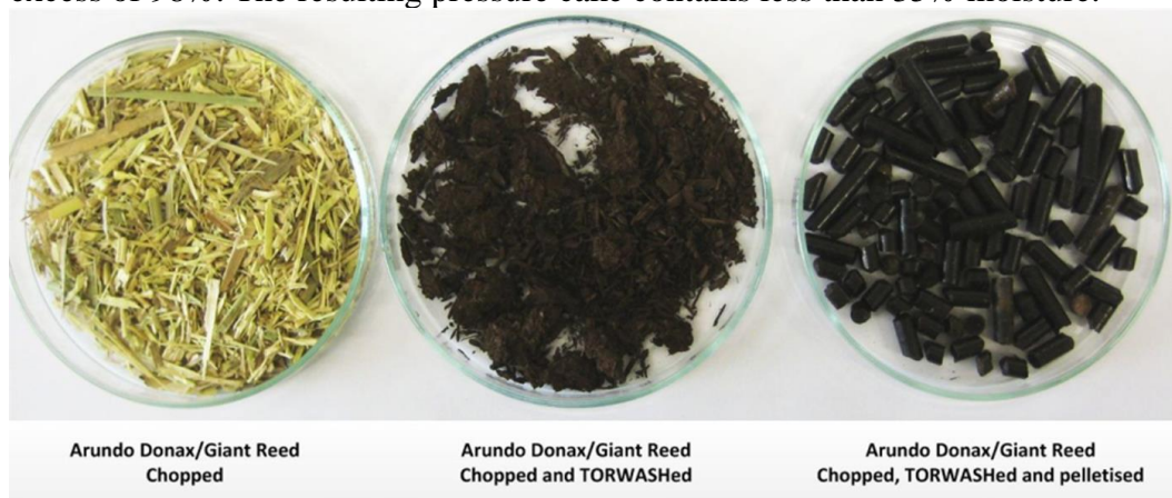
Untreated, torwashed and pelleted Arundo Donax Giant Reed

TORWASH, also known as wet torrefaction, is a hydrothermal treatment step that is performed under pressure, at temperatures between 150 and 250°C. The treatment changes the structure by making the fibres brittle therefore the biomass becomes easy to mill. Simultaneously water that permeates the biomass dissolves most chloride and alkali salts. After the heat treatment, the biomass is mechanically dewatered, in order to remove the majority of the water and salts without the use of thermal drying. The combination of washing, thermal treatment and mechanical dewatering allows typical for salt removal rates in excess of 98%. The resulting pressure cake contains less than 35% moisture.