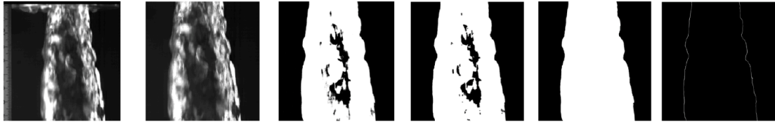
Figure n° 12.- DGHT algorithm steps