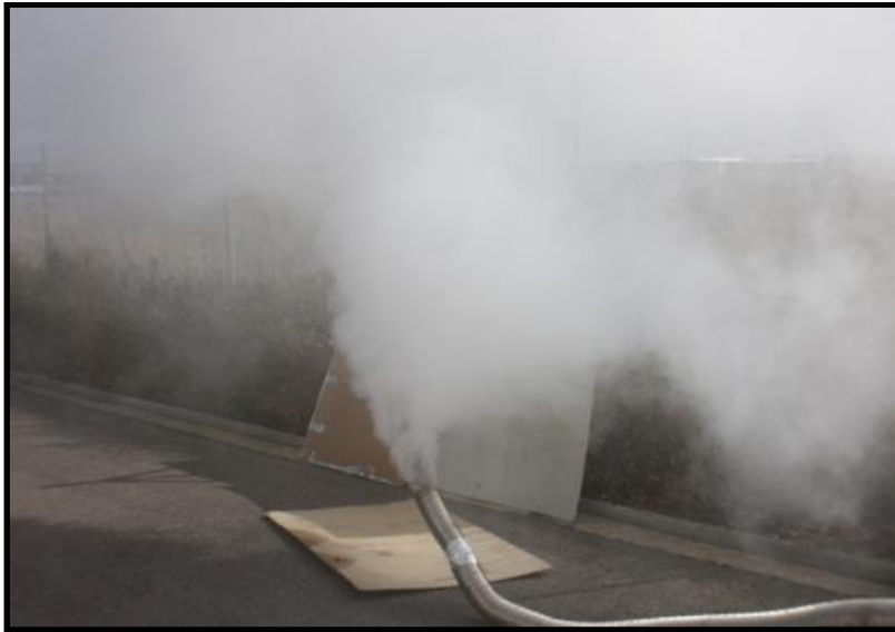
Figure 5: Project trial in CAMPOTEC facilities: Bath