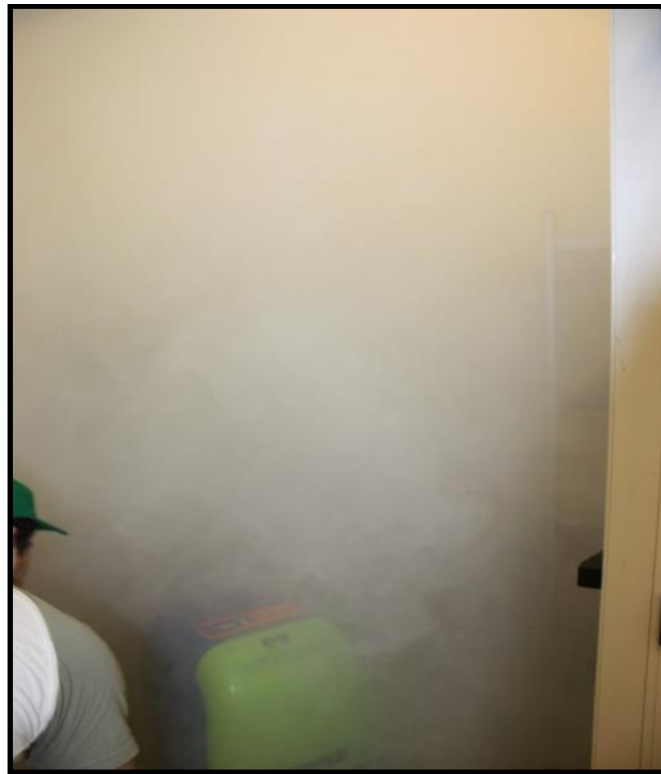
Figure 3: Fog formed into the chamber during AEROBRUMER application.