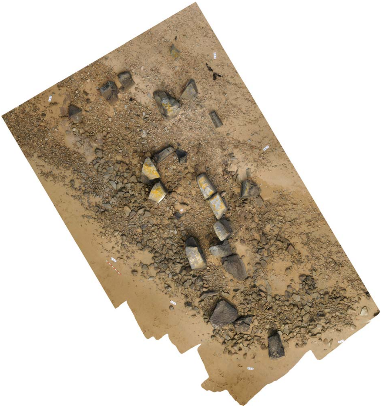
Figure 4. Orthophoto of the Neolithic gallery grave of Coalen (Brittany, France).