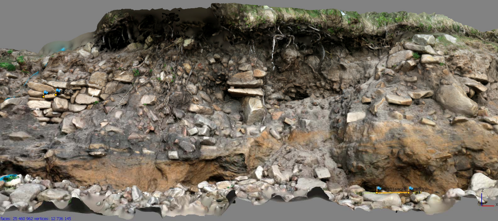
Figure 3. 3D photogrammetric model of Halangy Porth settlement (St. Mary's, Isles of Scilly, UK) created from photographs taken in April 2015.