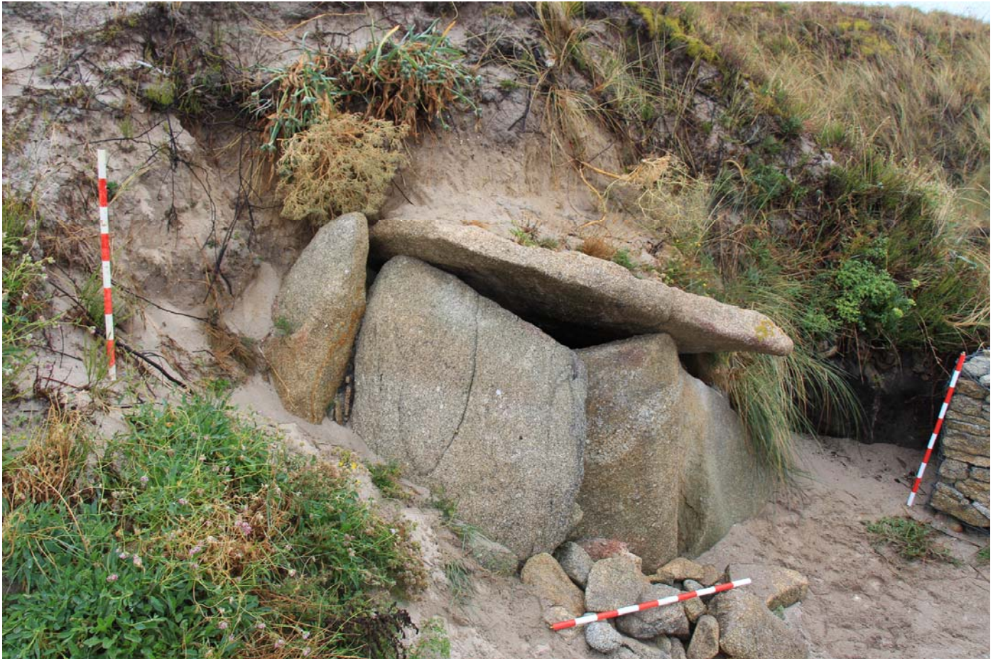
Figure 6. Monument 4 in the islet of Guidoiro Areoso (Galicia, NW Spain).