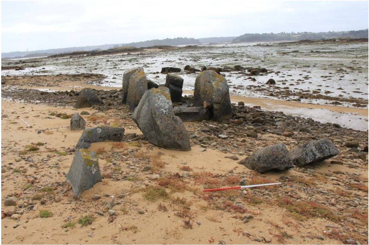
Figure 2. The Neolithic gallery grave of Coalen (Brittany, France).