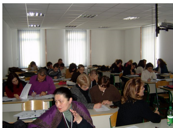
Training sessions for multipliers: Photos from the training in Podgorica (left) and Sarajevo (right).