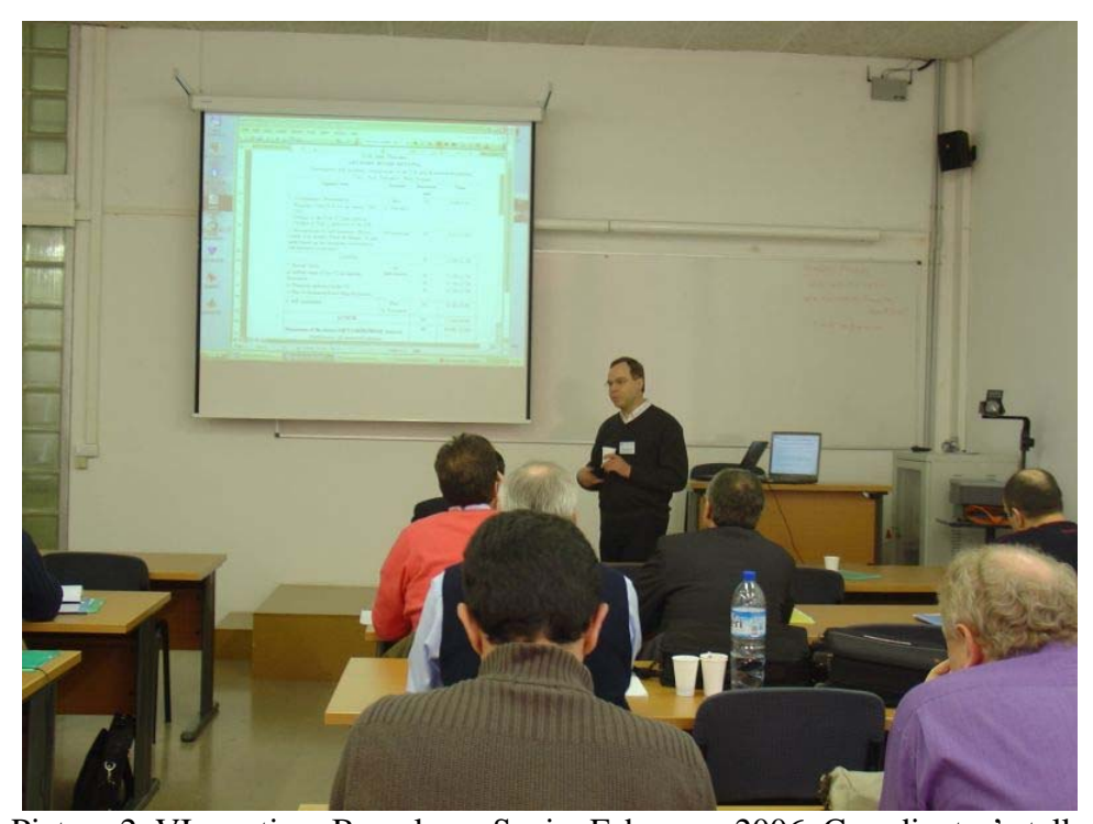
Picture 2. VI meeting, Barcelona, Spain, February, 2006. Coordinator's talk.