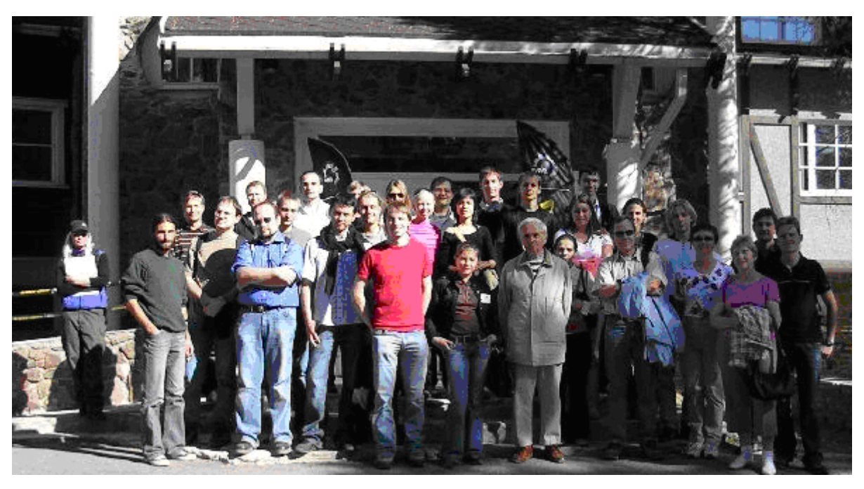
Picture 3: NoE PhD school in Rovaniemi, Lapland, Finland, August 2007. Students and teachers.