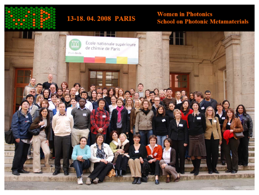
Picture 7: Joint event with PHOREMOST NoE: Women in Photonics (WiP 2008) event in Paris.