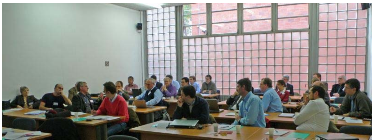
Picture 1: NoE Advisory Board meeting, Barcelona, Spain, February, 2006. VI discussion