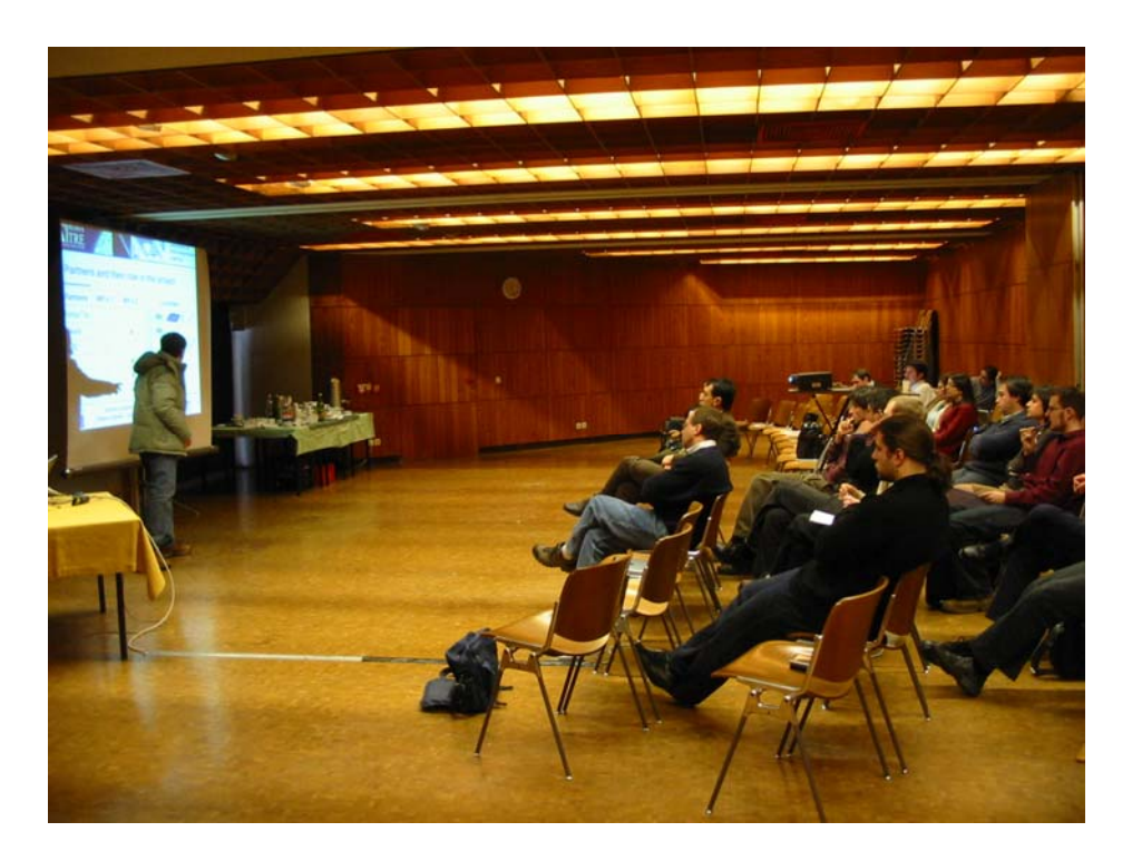
Picture 4. Discussion of the research mini-projects, Seefeld, Austria, January 2007.