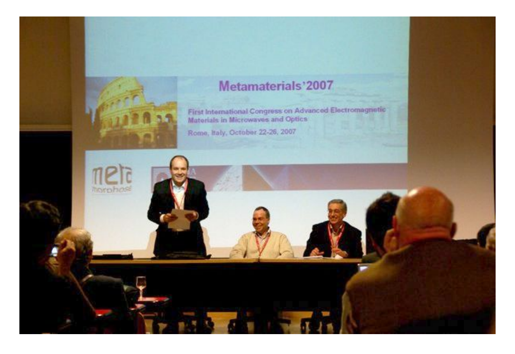
Picture 6: Closing ceremony of METAMATERIALS 2007 Congress, Rome, Italy.