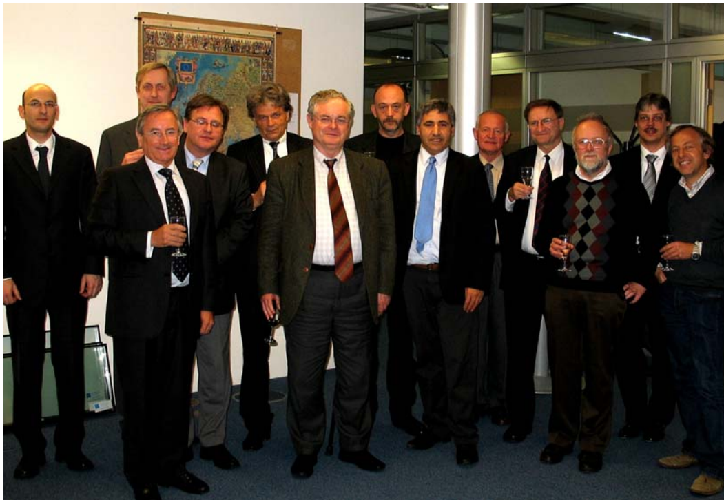
EURNEX member at Founding Meeting on October 30, 2008 in Berlin