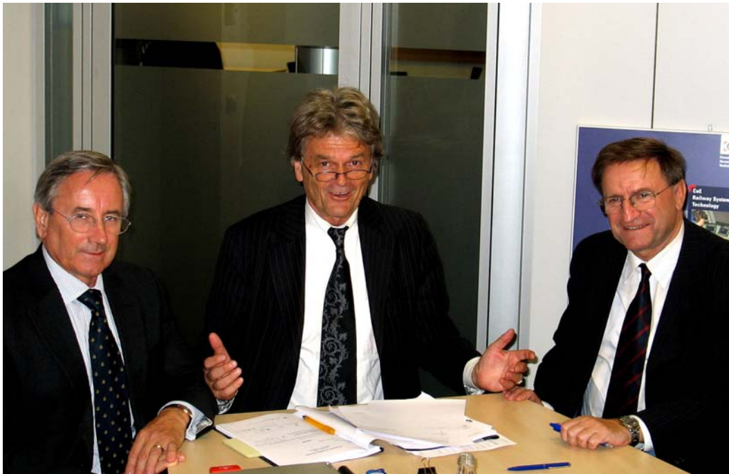
The Standing Committee of the EURNEX association

The EURNEX Corporate Office is located in Berlin, Germany.