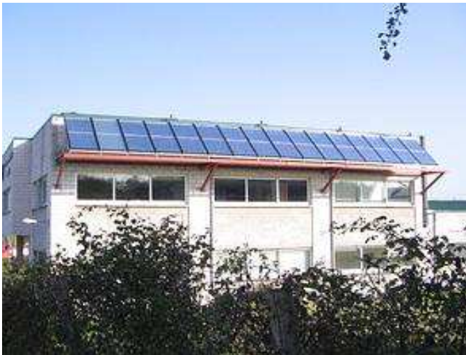
Building with CPC collectors (Asturias, Spain)

Its purpose is to provide cold on a temperature level of 0°C to -4°C. The final application area of FROST is the conservation of perishable products like food. The system has been constructed and has been installed in July 2006 at the Asociacion of the Meat Industry of Asturias (Noreña, Spain). It is currently operating under standard conditions.