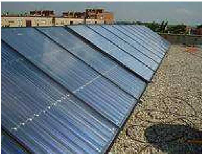
CPC Solar collectors on school roof (Sabadell, Spain)

The system has been installed in July 2006 at a school in Sabadell near Barcelona (Spain).