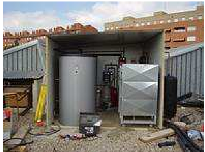
Installation of the AC system at school