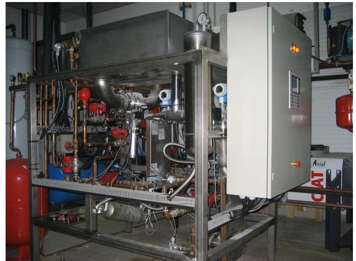
FROST unit, installed at the ASOCIACION