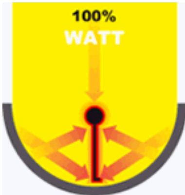
Mode of operation of the CPC – collector at vertical solar radiation

Despite numerous attempts to reduce the energy consumption of office buildings and residential houses (low or zero energy houses) are air conditioning systems often the sole alternative, to guarantee a comfortable room climate.