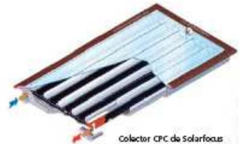
colector CPC de Solarfocus

Al emplear carbón activo y metanol como par adsorbente, se necesitan temperaturas de regeneración de aproximadamente 110 °C.