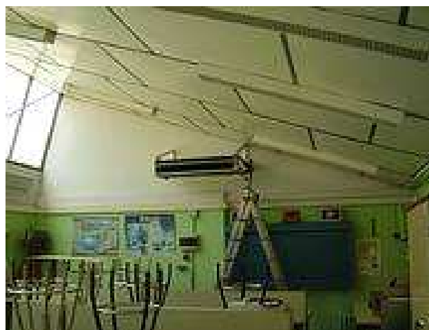
School room with solar cooling