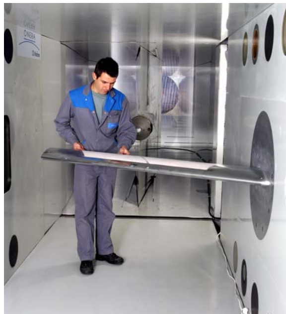
The model in the S2MA test section