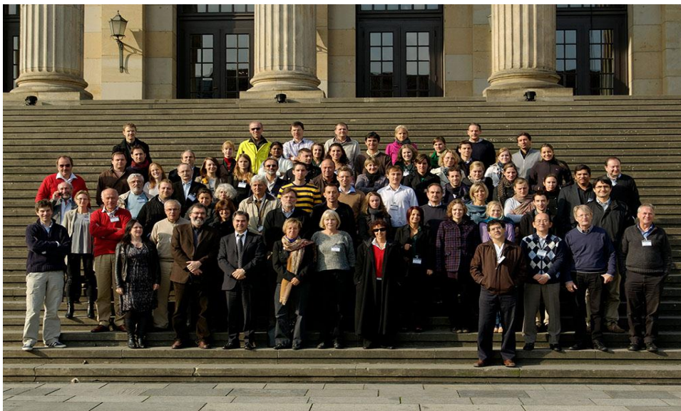
INNOCHEM final meeting, Berlin, October 11-13, 2010