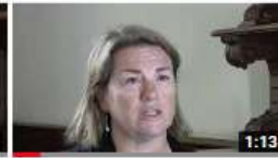
The PACE Project - Dissemination through the project 23 views • 1 year ago Unlisted