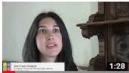
The PACE Project - Dissemination through the project 11 views • 1 year ago Unlisted