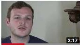
The PACE Project - Managing the project 7 views • 1 year ago Unlisted