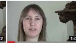
The PACE Project - Raising awareness of the project 6 views • 1 year ago Unlisted