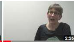
The PACE Project - Work Package 1 80 views • 1 year ago