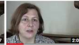
The PACE Project - Work across all Work Packages 27 views • 1 year ago Unlisted