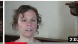
The PACE Project - Work Package 2 37 views • 1 year ago