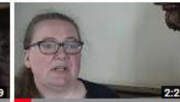
The PACE Project - Work Package 4 47 views • 1 year ago