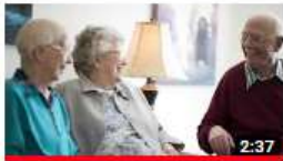
Massive Open Online Course (MOOC) - Improving Palliative Care 2 views • 1 day ago