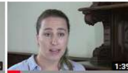
The PACE Project - Work Package 5 29 views • 1 year ago