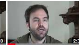
The PACE Project - Dissemination through Ageing 15 views • 1 year ago Unlisted