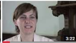
The PACE Project - An Overview of the Project 94 views • 1 year ago