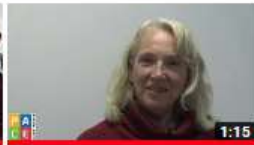
The PACE Project - Work Package 3 48 views • 1 year ago