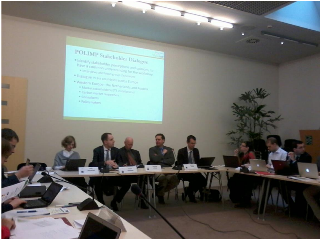
4 th POLIMP Stakeholders workshop