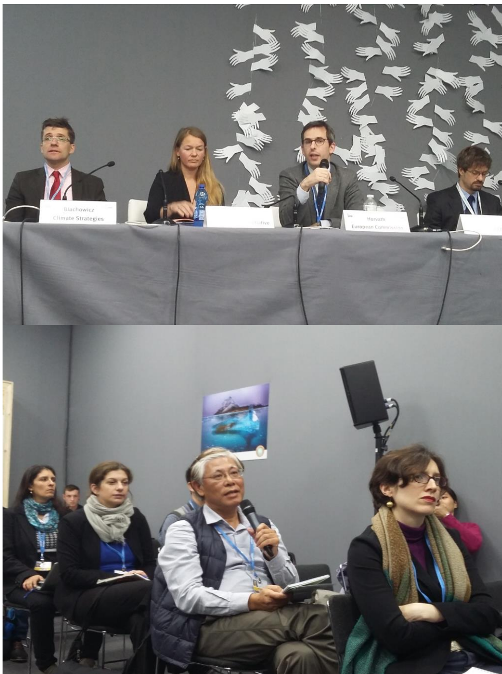
POLIMP Final Conference