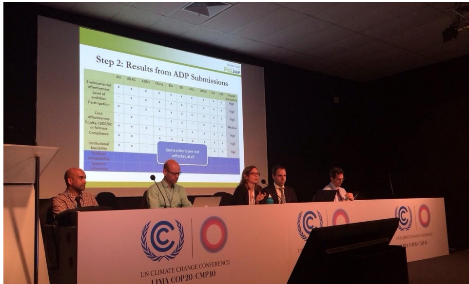
COP21 POLIMP Side Event