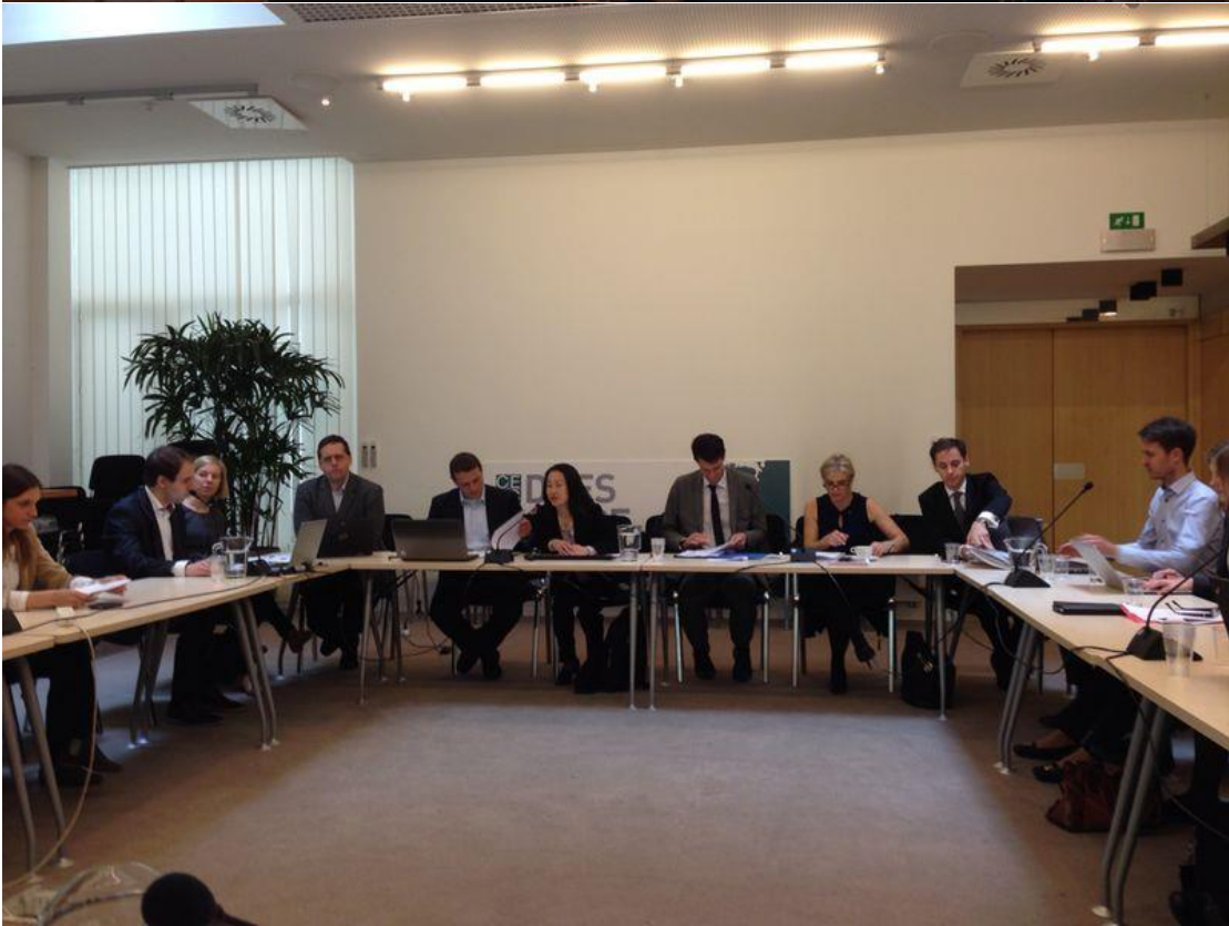
2nd POLIMP Stakeholder workshop