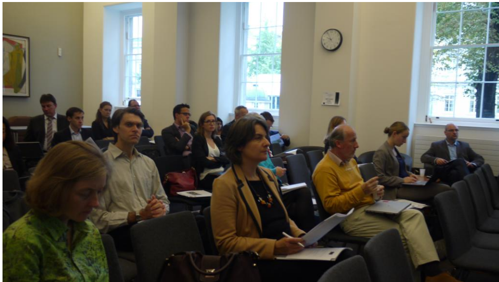
3 rd POLIMP Stakeholders Workshop