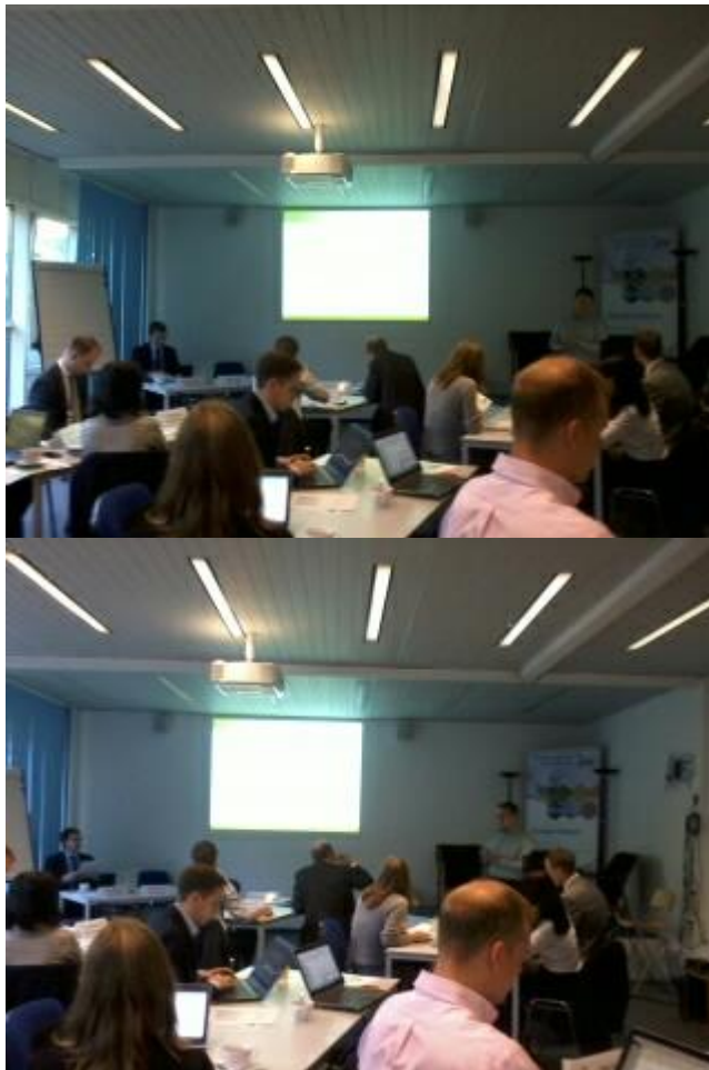
Climate Policy Info Hub