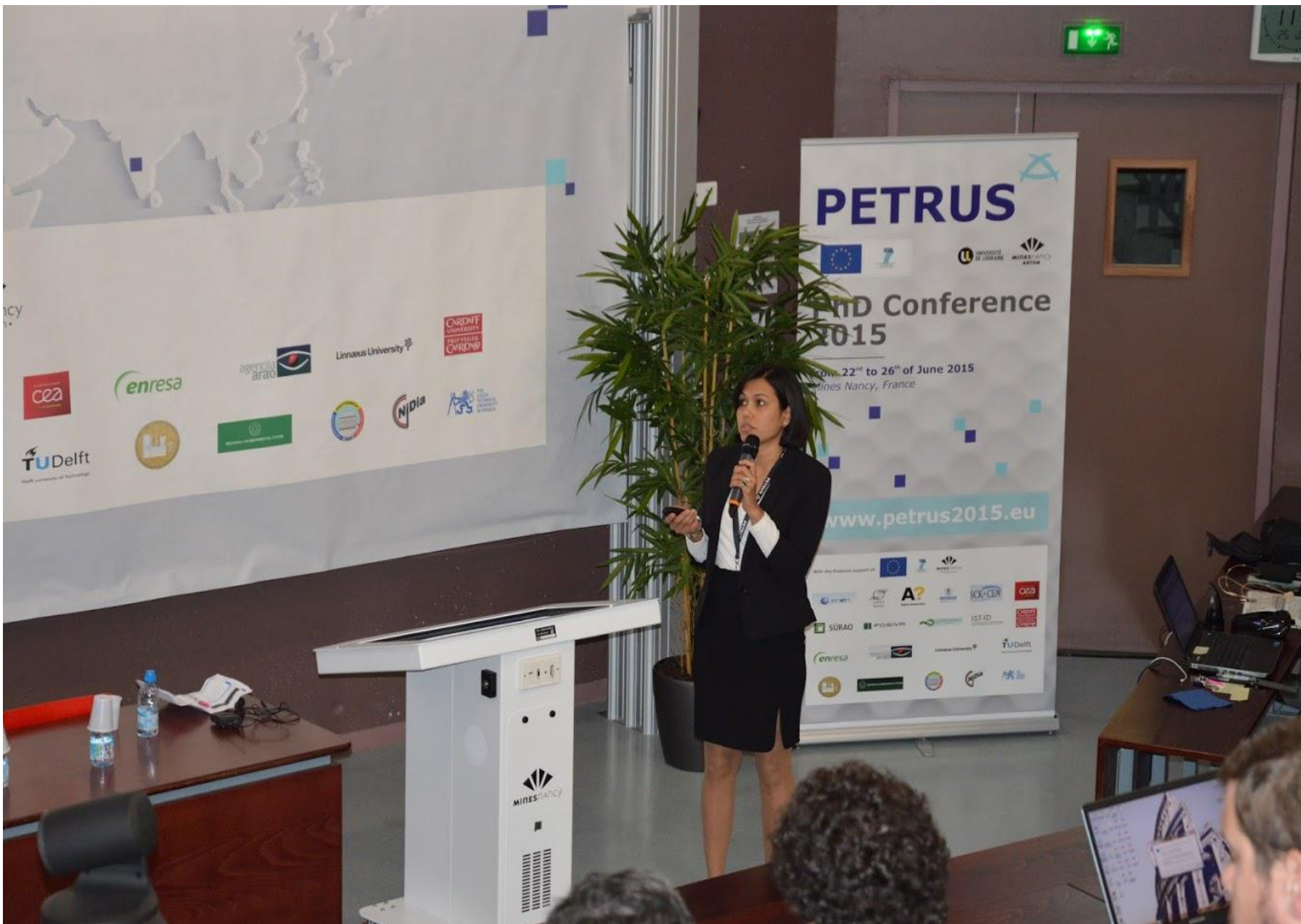
Student presentation at PETRUS PhD event 2015