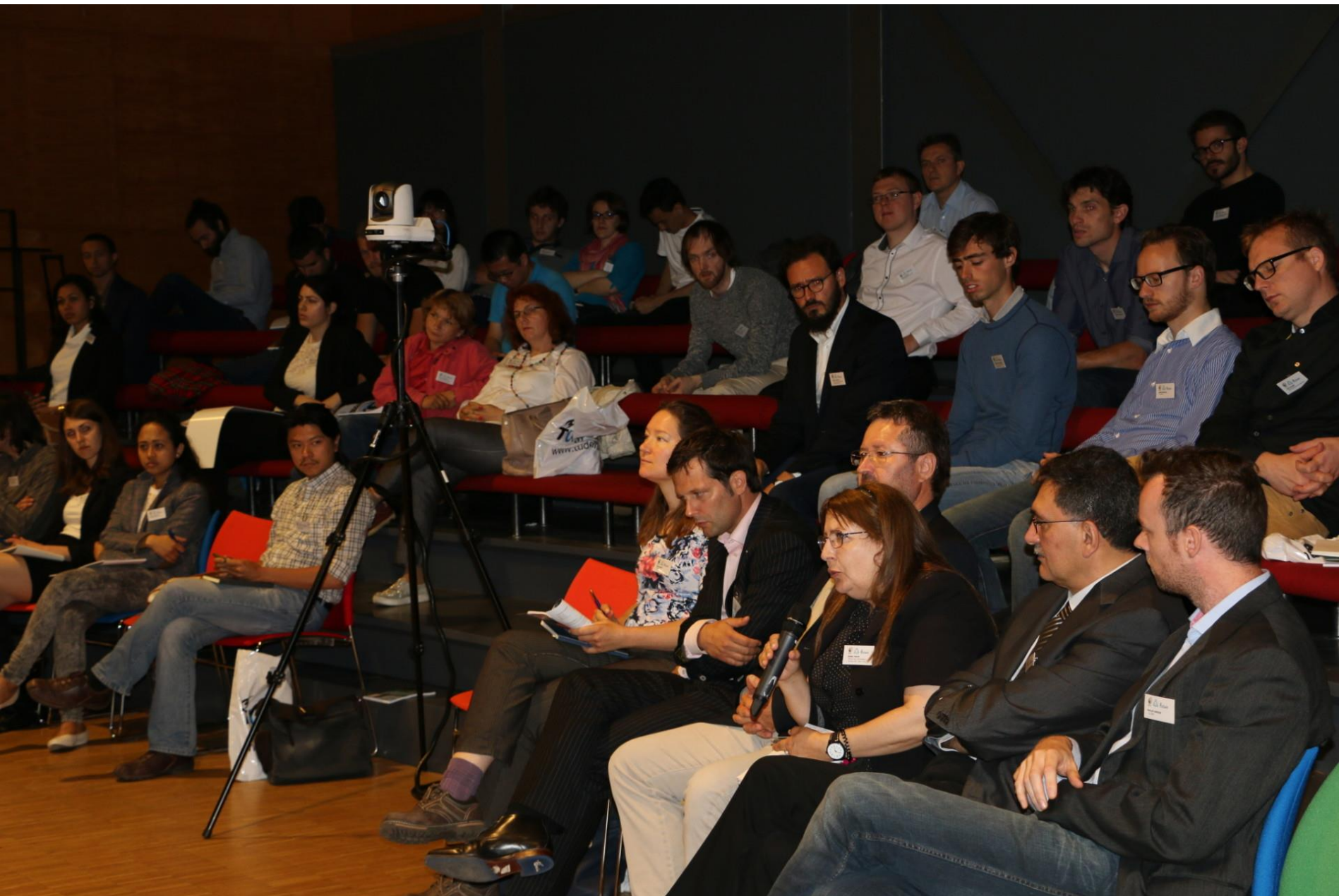
PETRUS-OPERA 2016 event